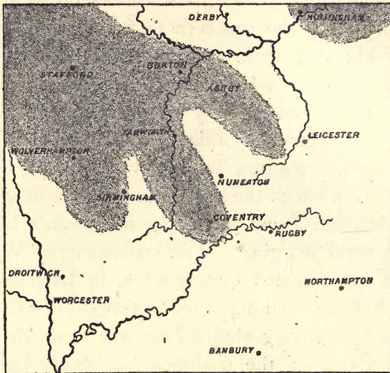
FIG. 1.—OUTLINE MAP OF THE MIDLAND DISTRICT, showing approximate Limits of the Coal-formation. Shaded portion shows coal-area both visible and concealed.

to the other tracts of concealed coal-measures, I propose to take them in the order in which they