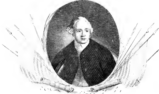
MAJ GEN JOSEPH WARREN Who was slain in the battle on Bunker Hill.

COMMEMORATIVE OF JUNE 17, 1775. CONSECRATED, JUNE 17, 1843.