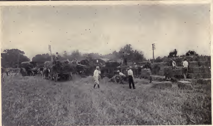
Agriculture on a Western basis brings lessons in organization, coöperation, and economy to Eastern boys. City boys working on a large farm near Phoenixville, Pennsylvania