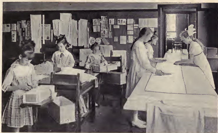
Service recognizes no school grading. Girls of the lower grades are snipping waste pieces for fracture pillows and working with the older girls who are cutting hospital bed shirts, Troy, New York