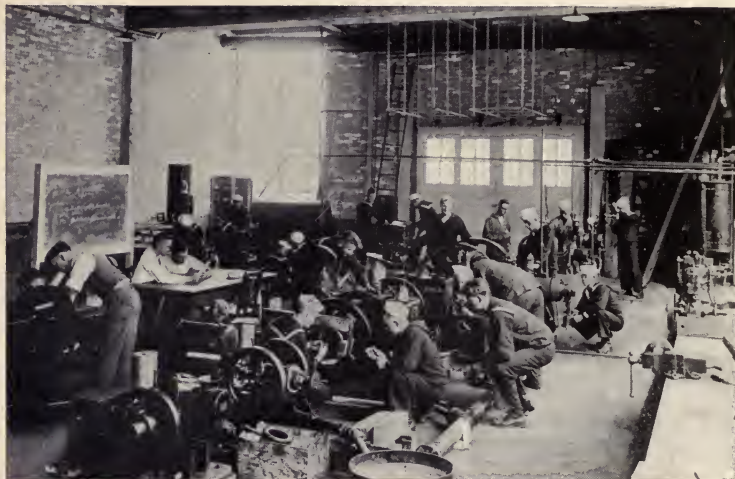
Educational efficiency as measured by its response to a national need. Dunwoody Institute is one of the several institutes teaching radiography and power testing to navy men