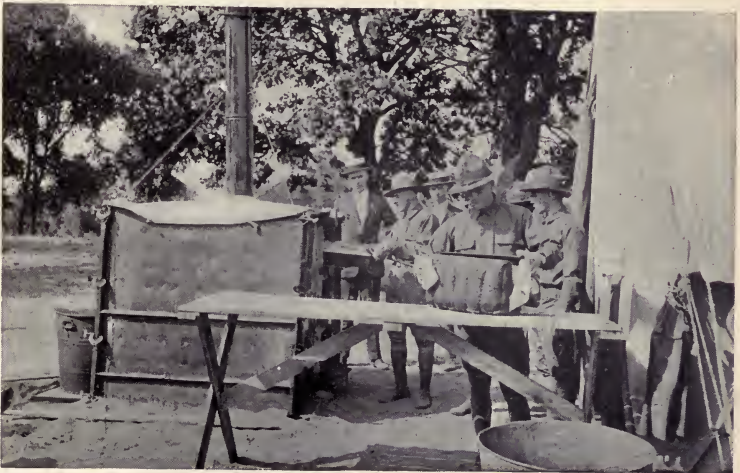
An example of an effective adaptation to a national need. Dunwoody Institute meeting a shortage of army bakers