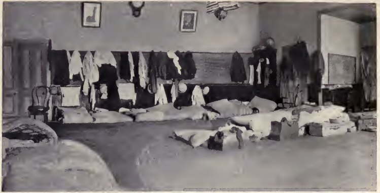
A country school need not be idle during the summer. This one housed a group of farm cadets