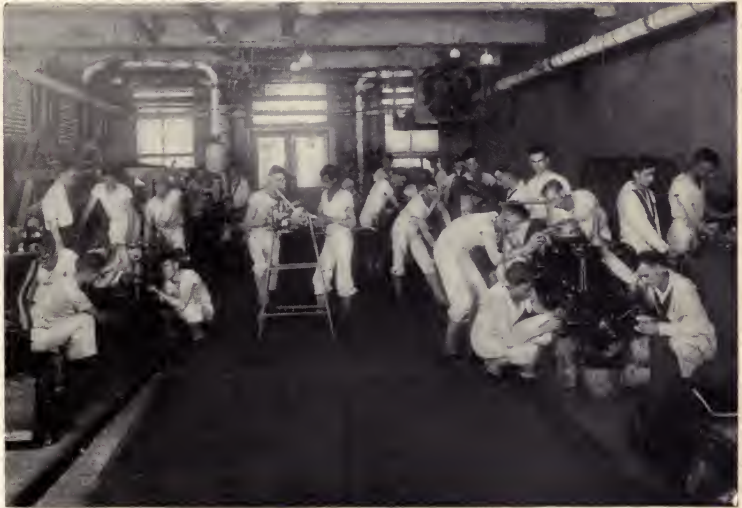
Technical colleges and institutes believe that education is the very last thing in which they ought to economize. Illustrations of class work in national-emergency courses for the army and navy given by Pratt Institute, Brooklyn, New York