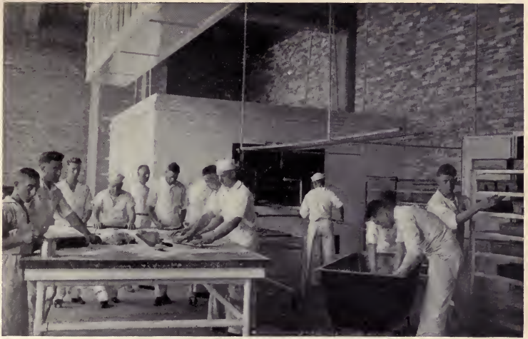
War needs open new fields for schools. After the war, stereotyped courses in trade schools and technical institutes will have lost their hold. Dunwoody Institute (Minneapolis, Minnesota) is one of the few schools having a training course for bakers