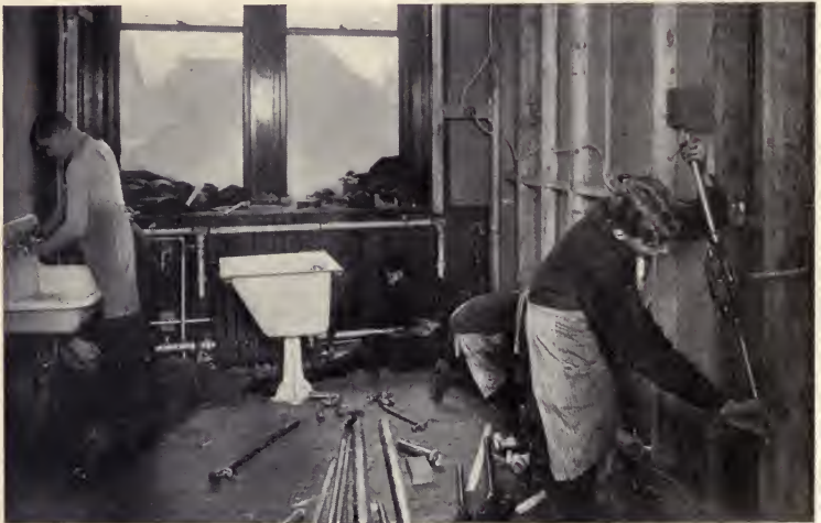
To learn a trade in an essential industry is to enlist in national preparedness. A corner of a Buffalo (New York) vocational school, teaching plumbing and steam fitting