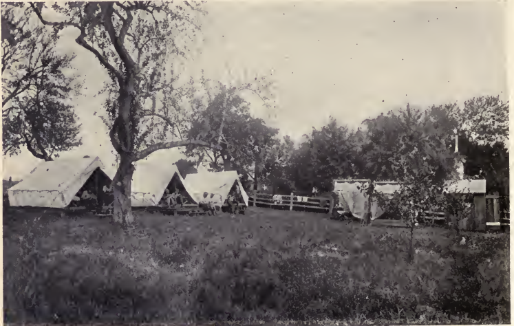
Employing able-bodied boys of city high schools for farm production may become permanent. It may lead to the development of country annexes to our city schools. Camp near Phoenixville, Pennsylvania