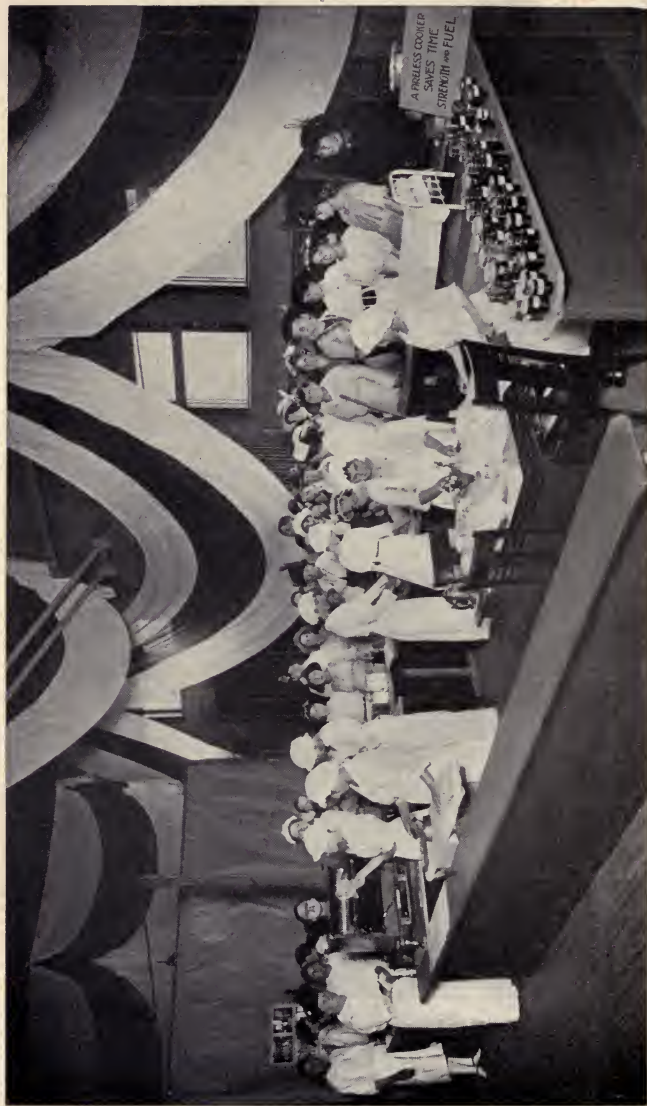
Girls at work; mothers watching. Why should not both work in a community kitchen equipped with evaporators, large containers, proper stoves, and utensils for doing a real piece of work?