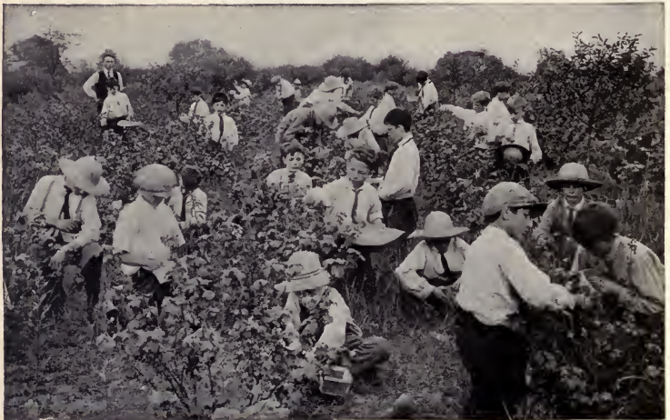
A lesson in service geography. Boys from Albany and Troy (New York) picking currants, near Hudson (New York), which were preserved in Yonkers Trades School for shipment to France