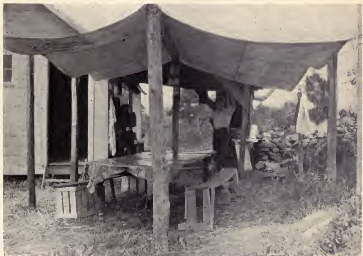
Working and living in the berry fields. One of twenty-five camps in the Highlands of New York State