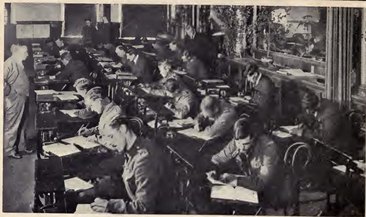
Returned convalescent soldiers, who would be idle but for the opportunity offered to brush up their education. Ogden Military Convalescent Hospital