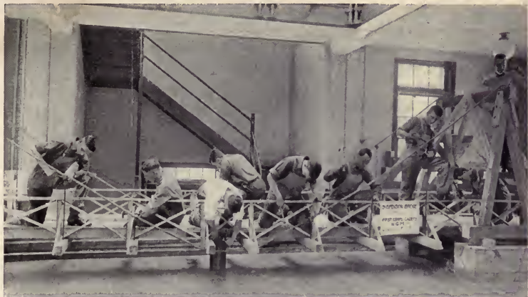
Military engineering will become a popular and necessary part of the curricula of our colleges and technical institutes. A class in suspension-bridge work at Wentworth Institute, Boston, Massachusetts