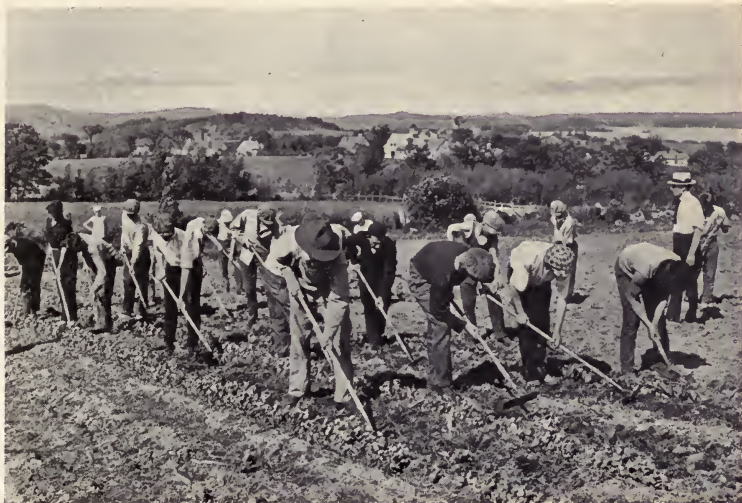
Even hoeing requires special training and was one activity in the pre-vocational course in agriculture given at the concentration and training camp for Junior Volunteers of Maine