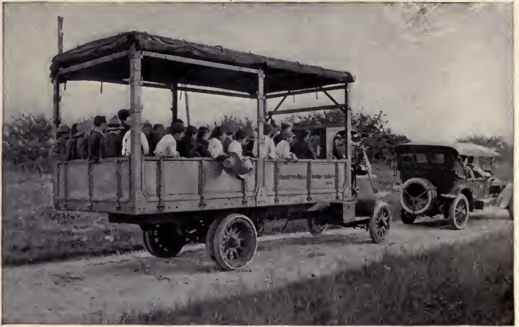
A day's outing for a purpose. Albany and Troy (New York) orphan-asylum boys on their way to "do their bit" in the currant fields