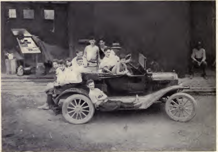
Flying squadron leaving camp on an emergency call for berry pickers at Highland, New York