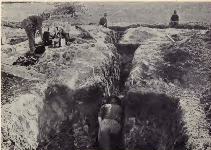
Military preparedness of college boys and schoolboys includes other activities than merely drilling. Trench drainage, one of a score of war emergency courses, at Wentworth Institute, Boston, Massachusetts