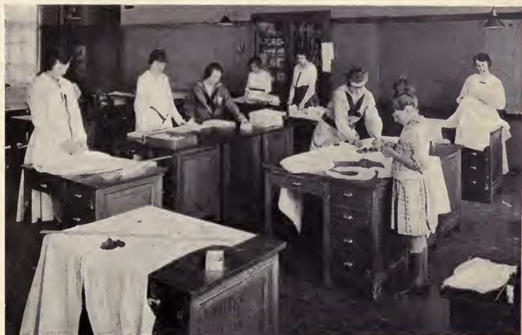
The new spirit of household arts in the schools is based upon the project plan and community service. War needs create new school practices. Troy (New York) girls at work on Red Cross supplies