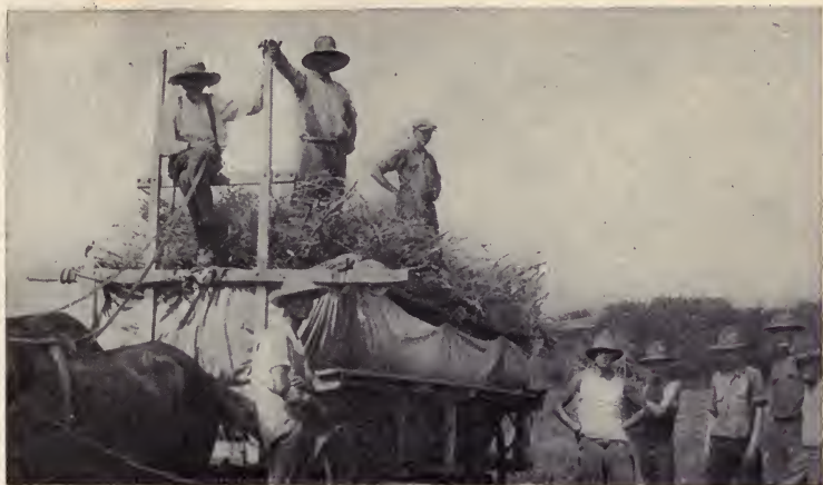
A farm camp is not merely a recreational camp, although it may re-create the city youth in terms of country life. A group of Long Island Food Reserve Battalion boys with the working impulse strong