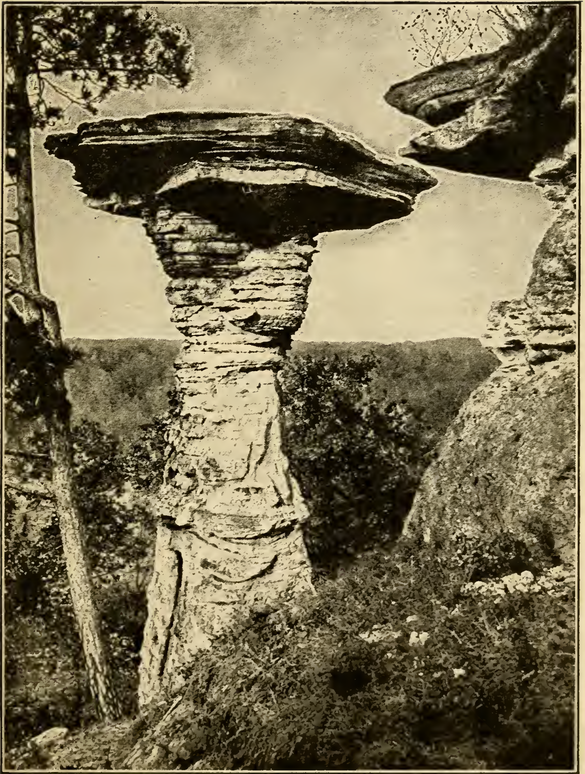
STAND ROCK, AT DALLES OF THE WISCONSIN