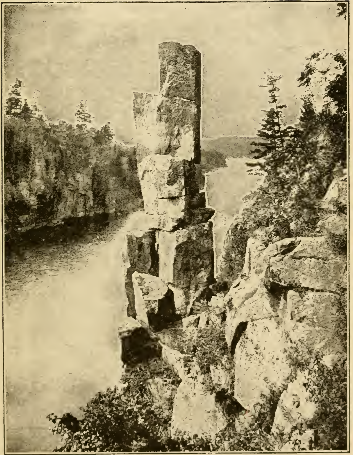
DEVILS CHAIR, AT DALLES OF THE ST. CROIX