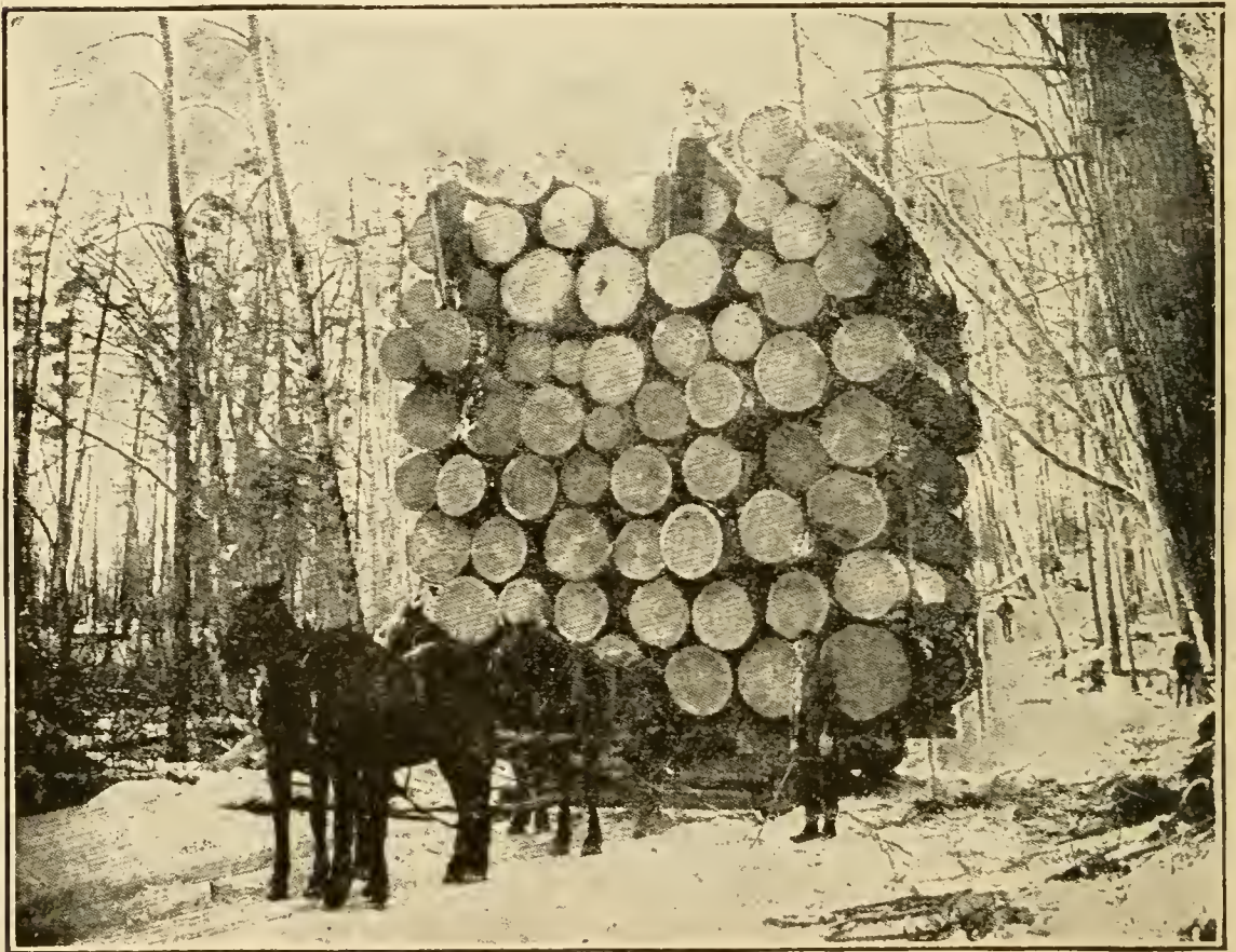
HAULING PINE LOGS (34,560 FEET)