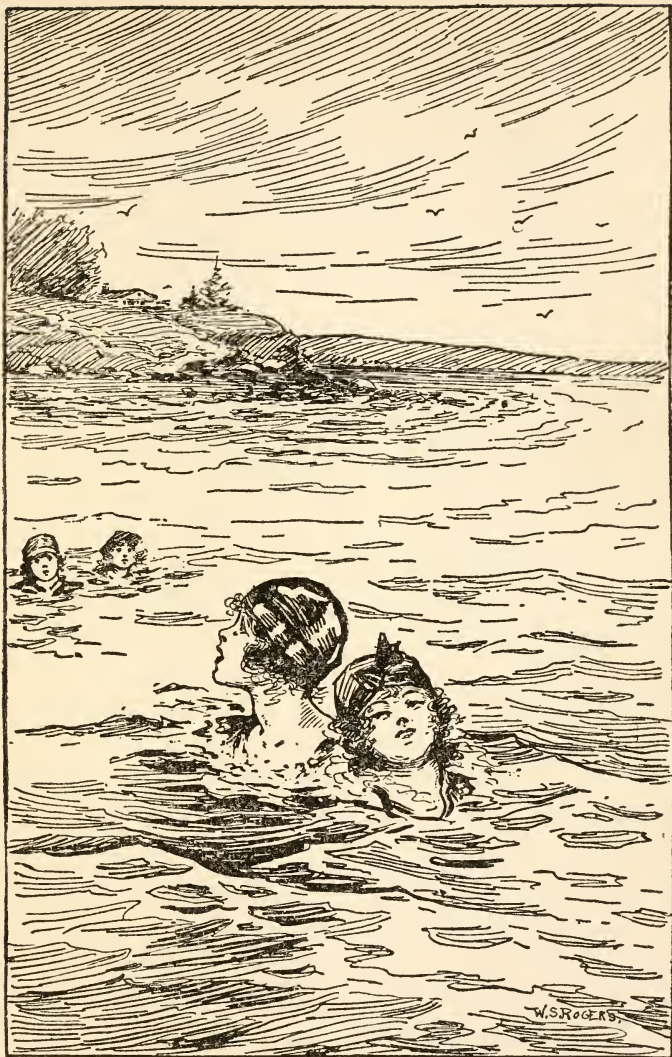
TWO OTHER BOBBING CAPS WERE COMING RAPIDLY NEARER. The Outdoor Girls at Bluff Point.