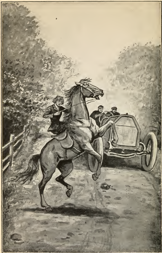
PRINCE JUMPED NERVOUSLY AND SHIED TO ONE SIDE. The Outdoor Girls at Rainbow Lake.