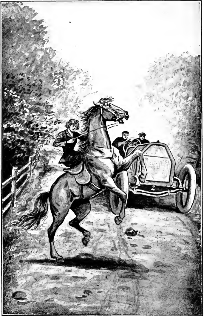
PRINCE JUMPED NERVOUSLY AND SHIED TO ONE SIDE. The Outdoor Girls at Rainbow Lake.