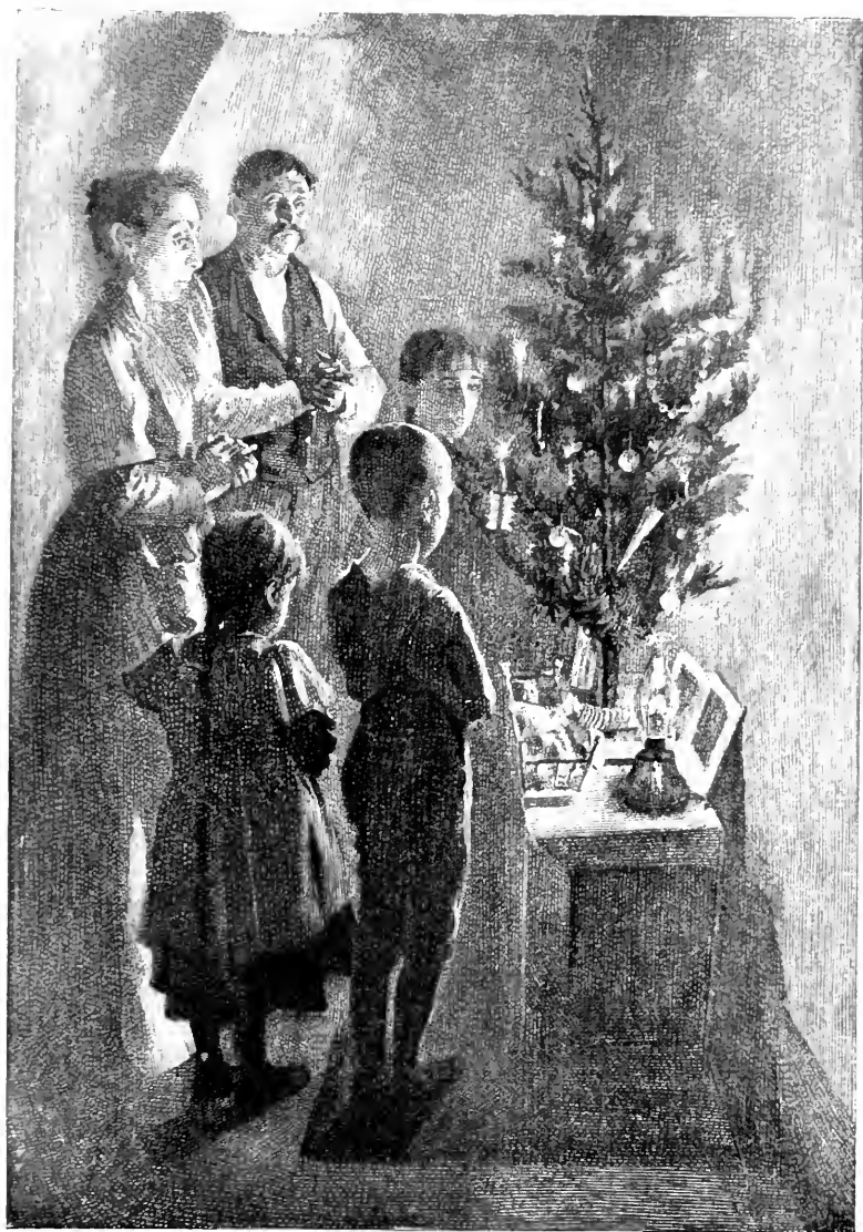
Merry Christmas in the Tenements.