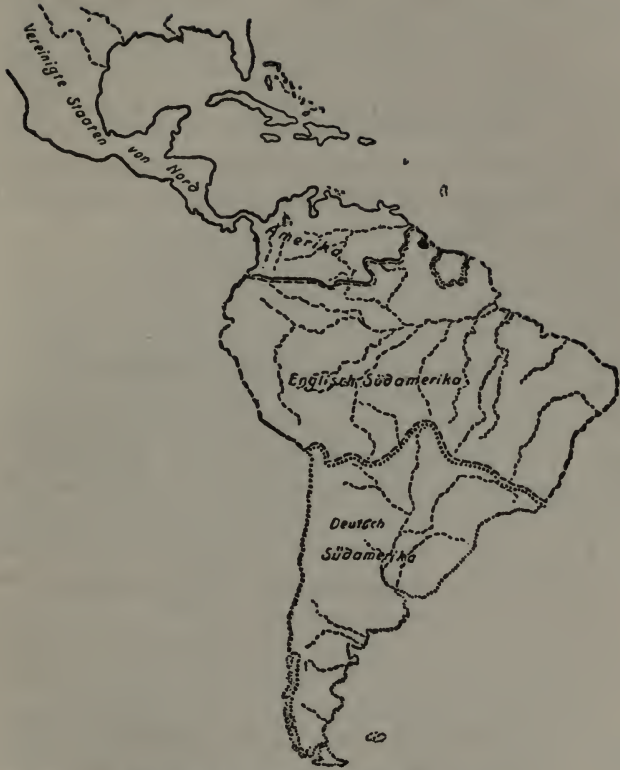
Map of Latin America, 1950

Tannenbergs, "Grossdeutschland" (1911), p. 255. It will be noted that the United States holds all Central America and the northern part of South America. Great Britain holds the valley of the Amazon and all the central districts from ocean to ocean. The Pan-Germanists are content to take those regions only that lie within the temperate climatic zone, in the southern third of South America.