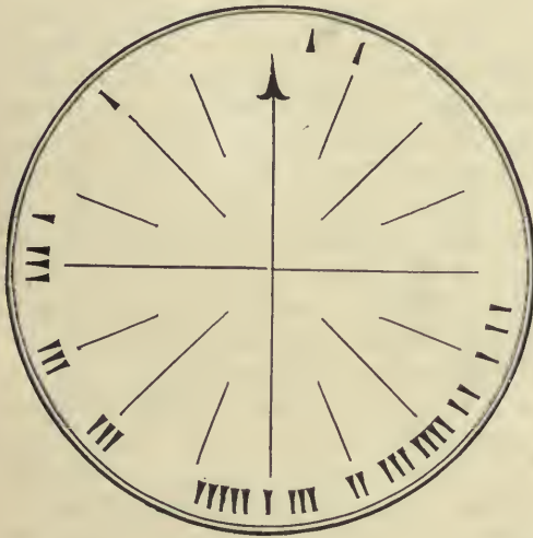
DIAGRAM SHOWING DIRECTION OF FALL.

Lastly, the effect of extensive burns at the base of the trees must be noticed, since it in part coöperates with the tendency just spoken of, and in part modifies it. The effect of a burn is to destroy the vitality of parts below the burn, rather than above, since the nourishment moves downward. A burn, then, at the collar of the tree, deprives the roots immediately beneath of their life, and they perish hopelessly to their remotest fibers. In trees which have grown to the size of these Sequoias, and have their far-reaching root-system, such a burn may be a very extensive one—may involve even half of the circumference, perhaps—and still not immediately cripple the growth above to any great extent. Water is all that the leaf-laborato-