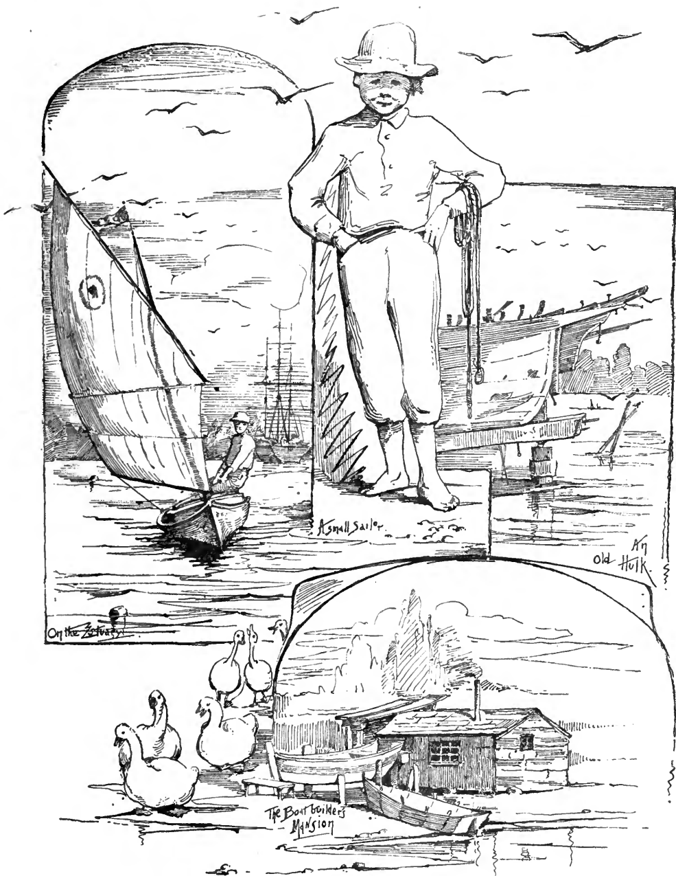
Views on Oakland Creek.