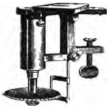
Flatters Microtome, £2, 10s.