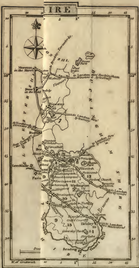
The County, by different Colours, Superior Edition.