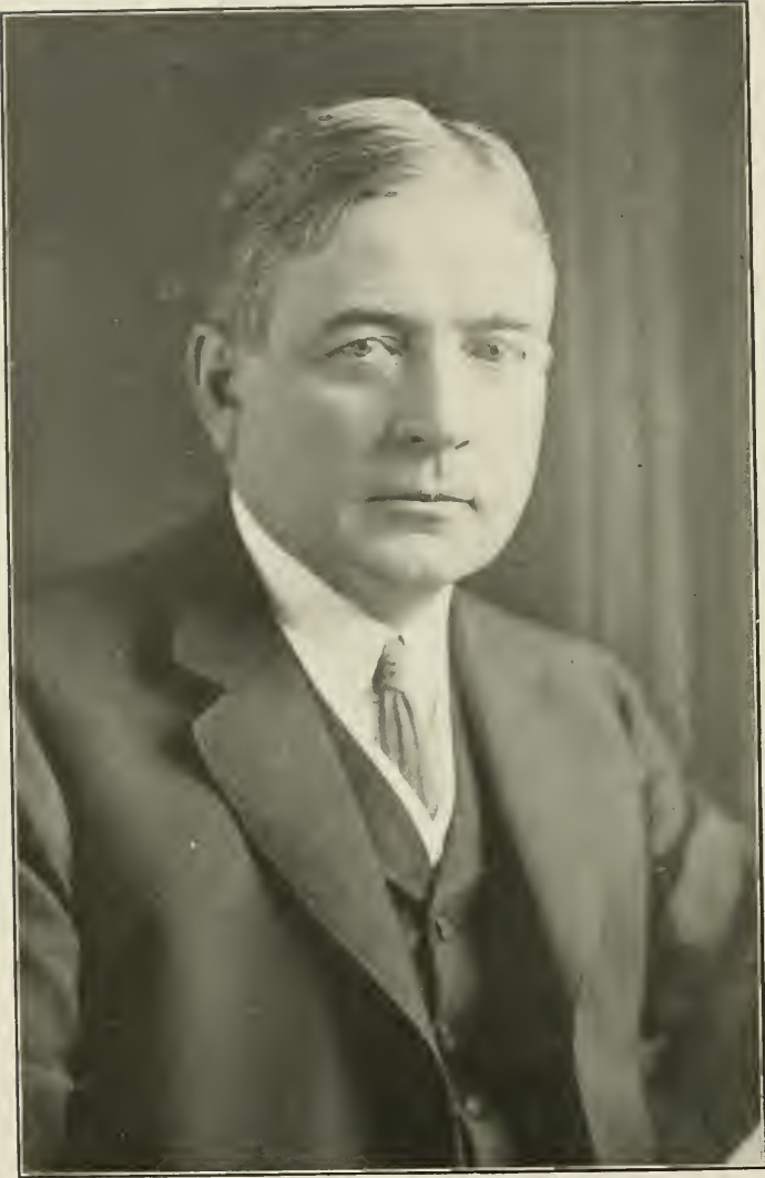
Frank P. Underwood