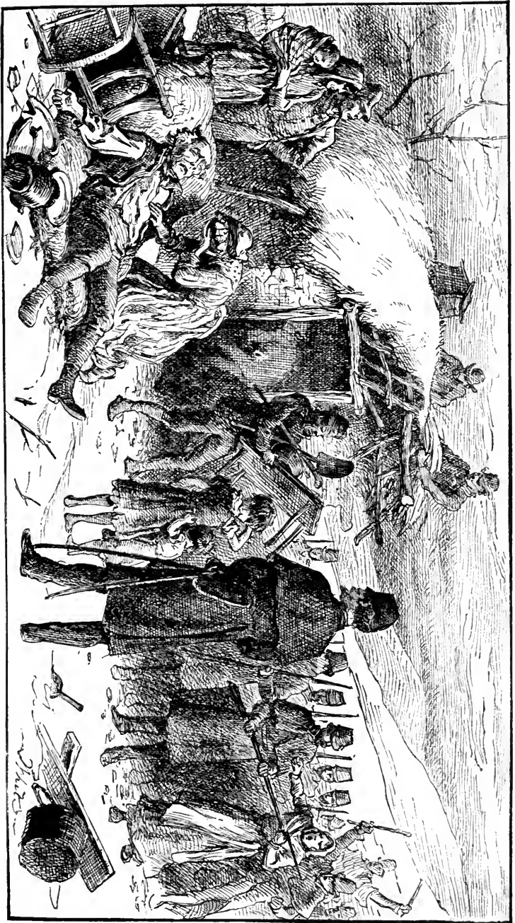
“THE FAMILY WERE FLUNG OUT LIKE VERMIN, AND THE WORK OF DEMOLITION OCCUPIED BUT A FEW MINUTES.”—Page 172.