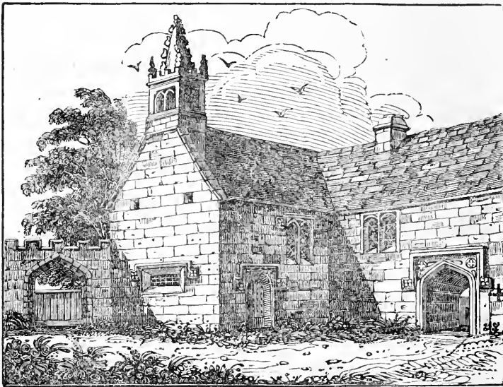
CHAPEL AT COTEHELE.

“The interior of the Hall is very interesting. The roof is timber, and arched; and on the walls hang various pieces of armour and weapons of considerable antiquity, with a complete suit of armour, which is probably not older than the Civil wars. In the end walls are apertures in the shape of a quatrefoil, which admit a view of the hall from adjacent apartments, and would allow the motions of persons assembled in it to be watched. There are some specimens of ancient furniture in the hall; in particular a chair having the date 1627. In the windows are several armorial shields in stained glass.