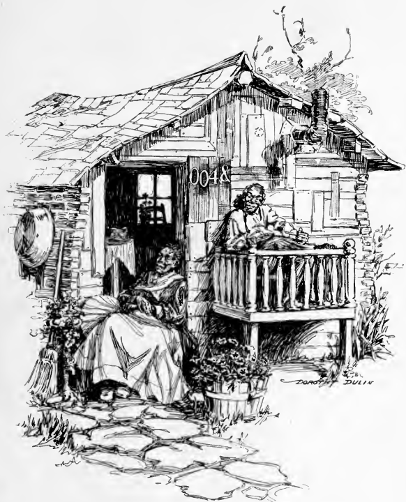
“An house . . . made with hands”