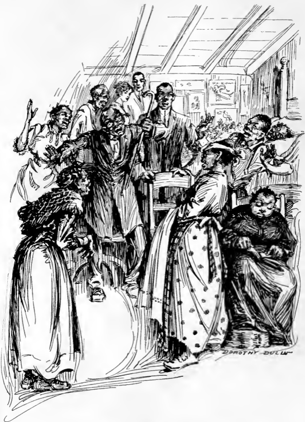
Feet tapping, bodies swaying, their eyes running over