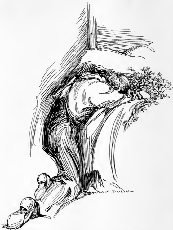
Unk Jerry's head bent low as the healing words flowed on