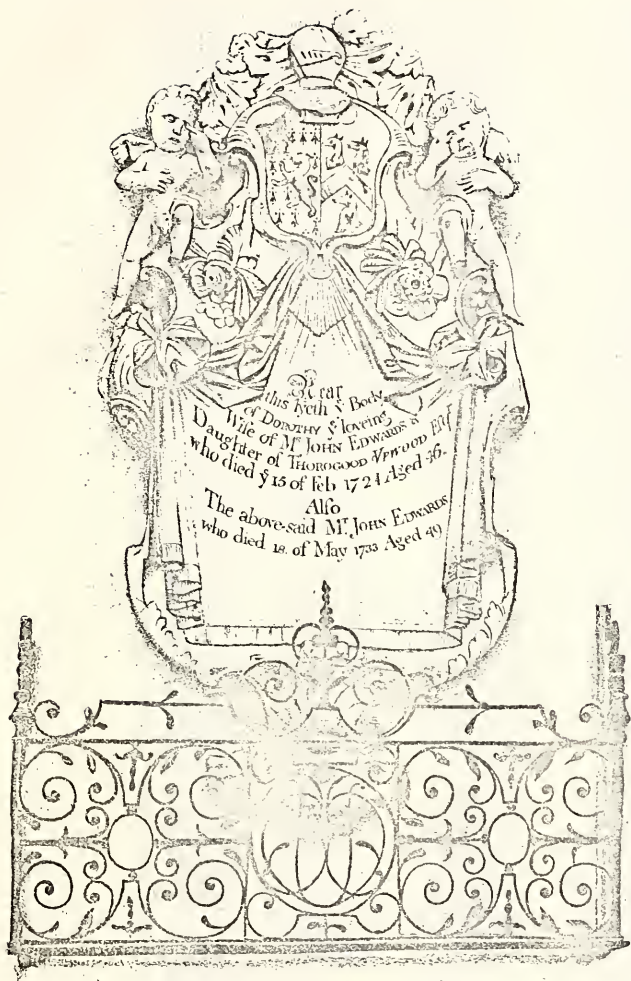
TABLET, TERRINGTON, ST. CLEMENT'S.