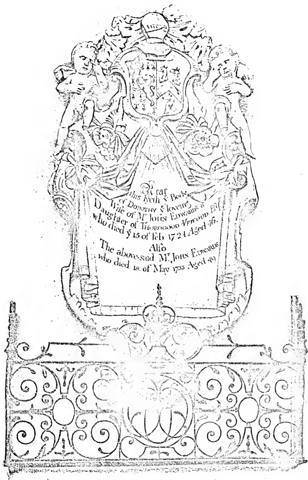
TABLET, TERRINGTON, ST. CLEMENT'S.