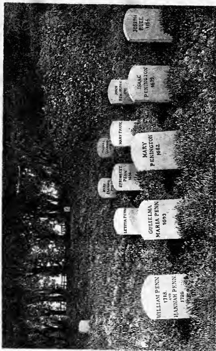
GRAVESTONES OF THE PENNINGTONS IN THE CEMETERY AT PENNINGTON, WILTSHIRE