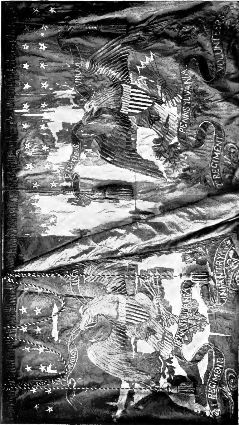
FLAGS PRESENTED TO THE FIRST AND SECOND REGIMENTS, PENNSYLVANIA VOLUNTEERS, BY GENERAL SCOTT, IN THE CITY OF MEXICO.