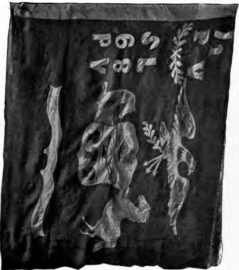
FLAG MADE BY THE PENNSYLVANIA VOLUNTEERS WHILE EN ROUTE TO MEXICO, AND SUBSEQUENTLY USED BY THE "SCOTT LEGION" DURING THE LATE REBELLION.