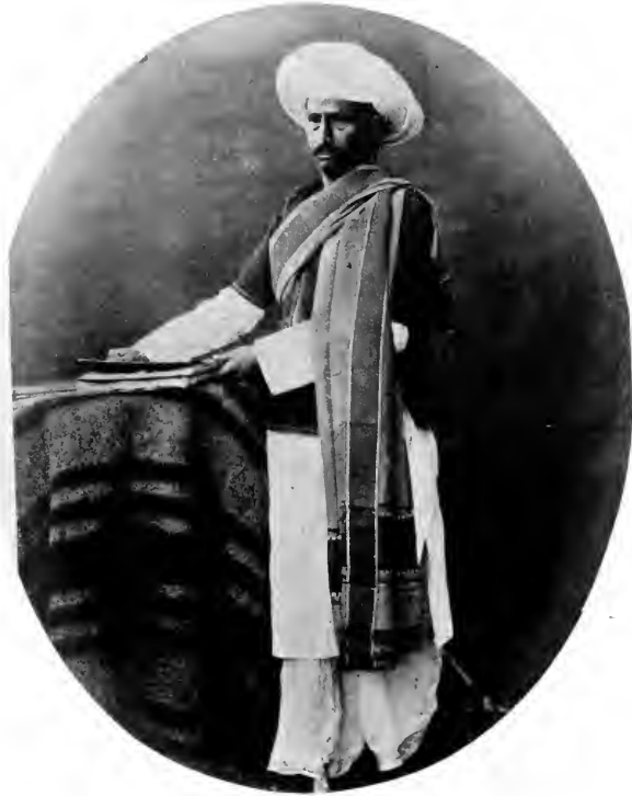
SHROFF OR NATIVE BANKER. HINDOO. SIND. 350.