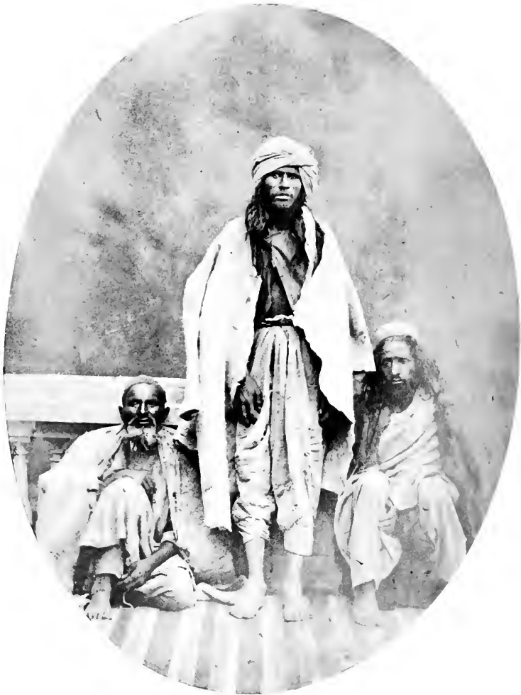
BRAHOOEES. UNARMED. INHABITANTS OF KHELAT STATE, SOONNEE MAHOMEDANS. SIND. 321-2.