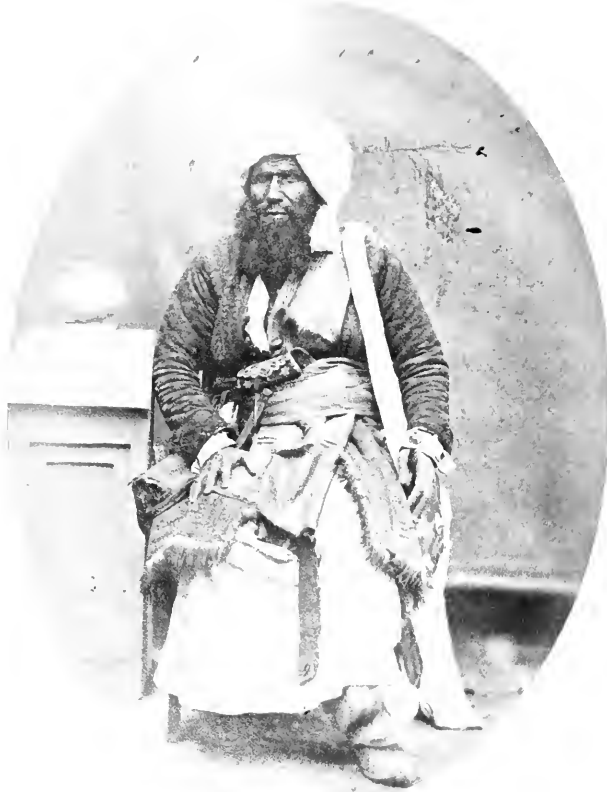
YUROO KHOSA BELOCH FRONTIER TRIBE. SOONNEE MUSSULMAN SIND. 306.