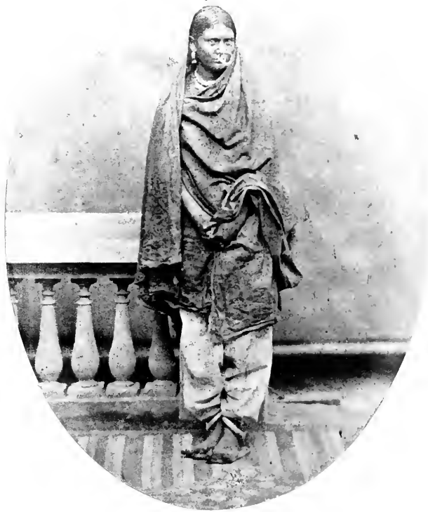
MOHANA WOMAN. SOONNEE MUSSULMAN SIND. 358-2