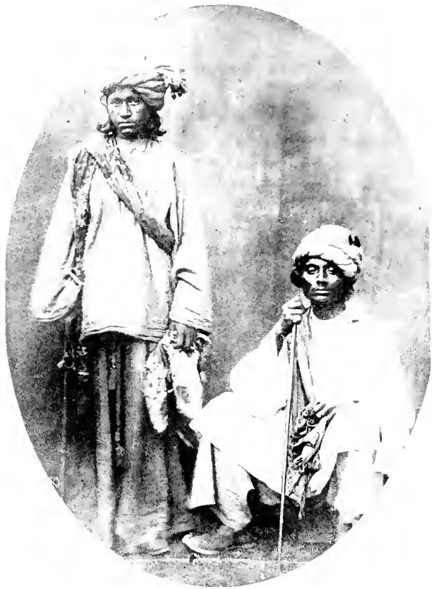
TWO SINDEES. SOONNEE MUSSULMANS. SIND. 318.