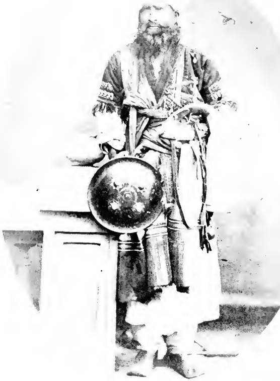
RIND. BELOCH TRIBE. SOONEE MUSSULMAN. SIND. 298.