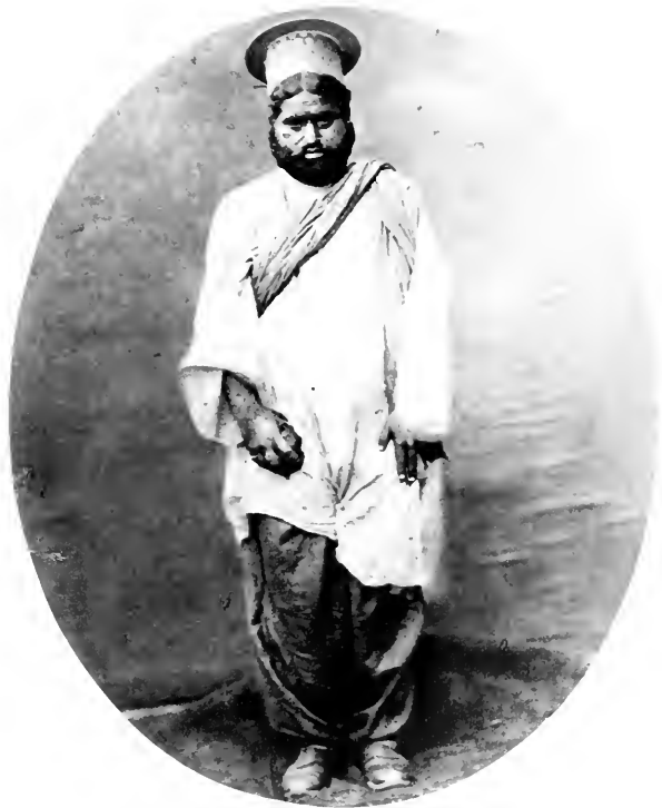
A NAREJA ANCIENT SINDEE TRIBE. SOONNEE MUSSULMAN. SIND. 314.