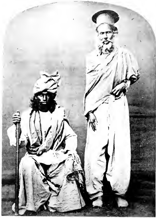
A SINDEE AND BELOCHEE. MUSSULMANS. SIND. S11.