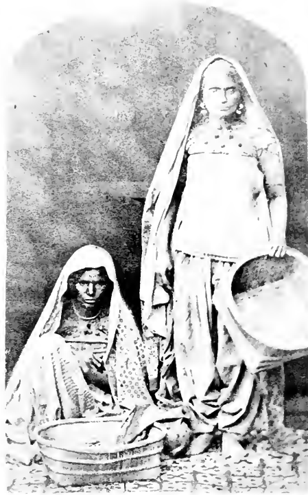
SELLERS OF FISH. MUSSULMANS. SIND. 339.