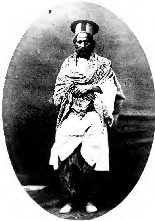
A PONHAR, ANCIENT SINDEE TRIBE. SOONNEE MUSSULMAN.