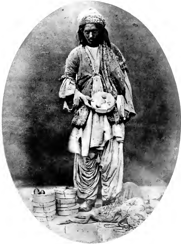
AFGHAN FRUIT SELLER. SOONNEE MUSSULMAN. SIND. 333.