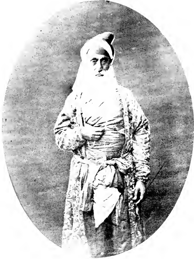
SIKH ARALI FROM THE PUNJAB SIKH SIND 1854