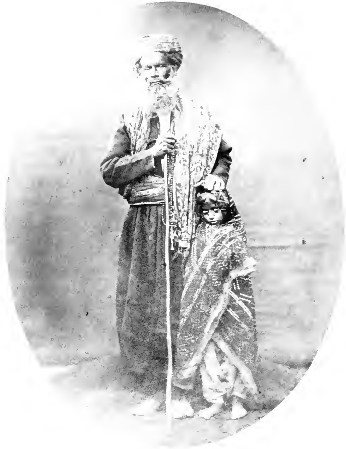
A NOOMRYA AND HIS DAUGHTER, SOONNEE MUSSULMANS. SIND.