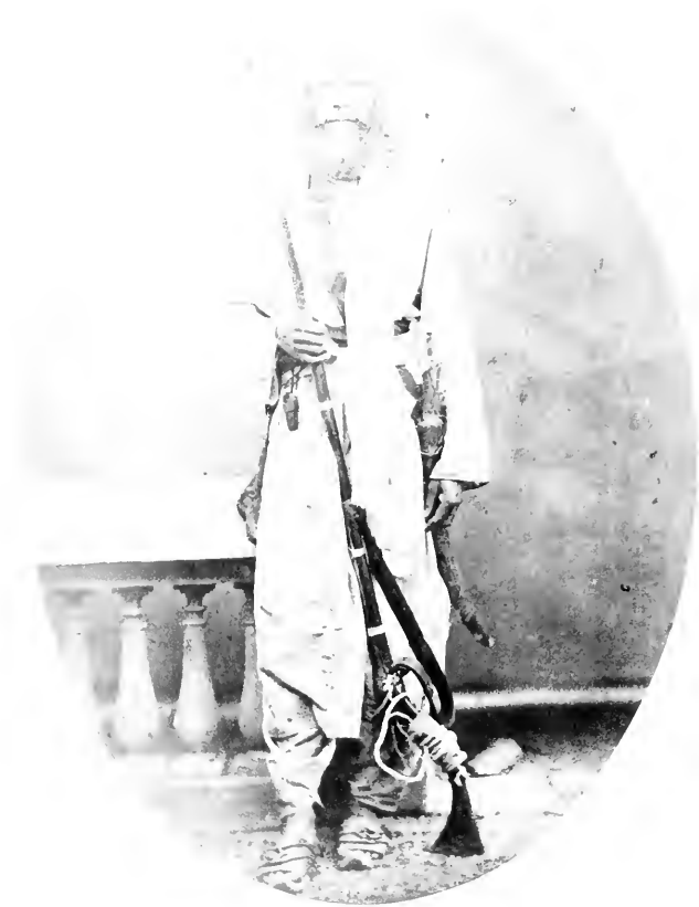
GABOLE. BELOCH MILITARY TRIBE. SOONNEE MUSSULMAN. SIND. 308.