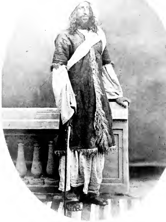
A JUTT. BELOCH TRIBE SOONNEE MUSSULMAN. SIND. 310.