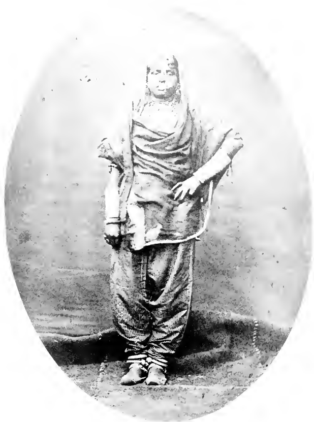
DANCING GIRL. HINDOO. SIND. 340.