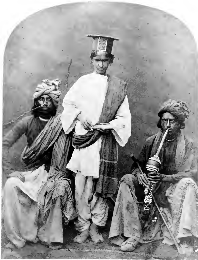
LANGHANS. MINSTRELS. SOONNEE MUSSULMANS. SIND. 335.