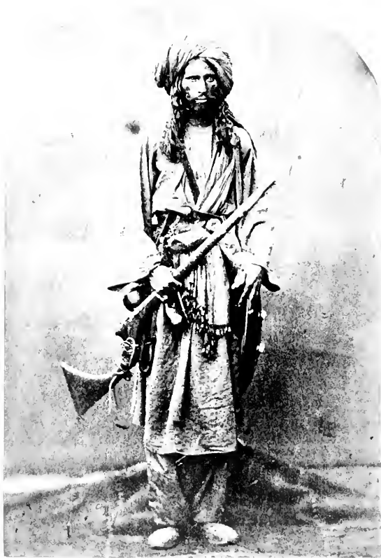
A KHOSA BELOCH FRONTIER TRIBE. SOONNEE MUSSULMAN. SIND.