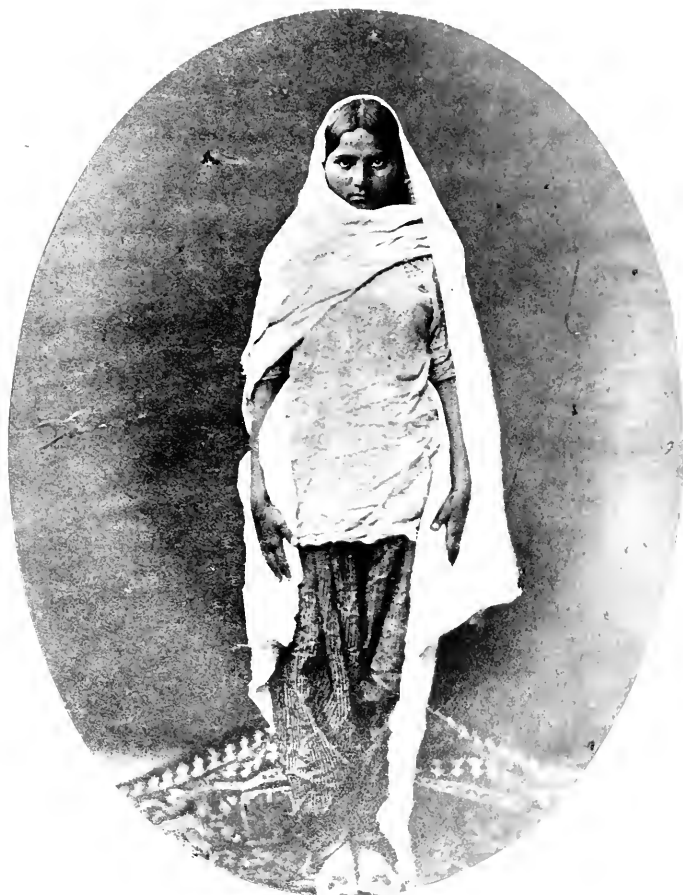
SINDEE WOMAN MUSSULMAN. SIND. 319