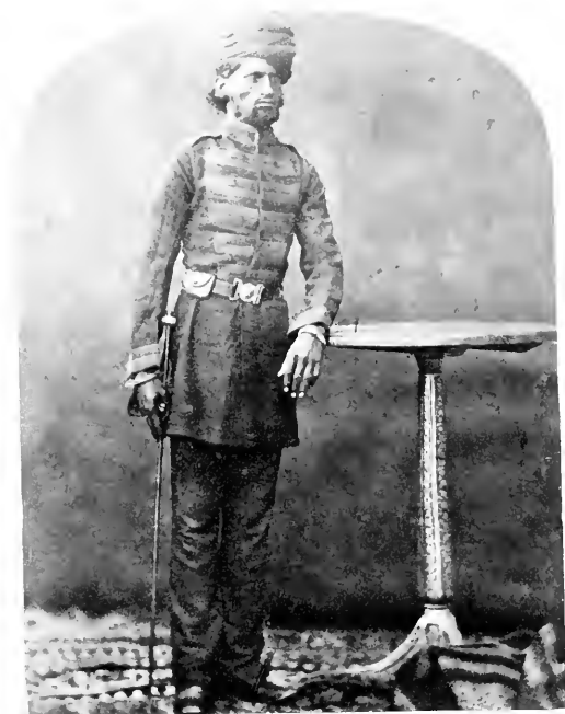
PRIVATE SECOND BELOCH REGT. SOONNEE MUSSULMAN. SIND. 328.