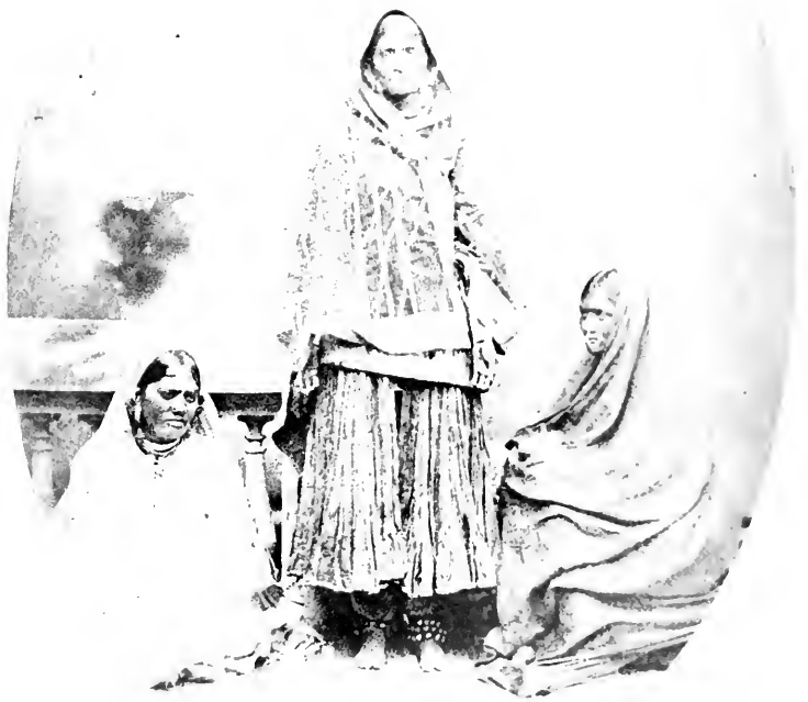
MOHANA WOMEN SOONNEE MUSSULMANS. SIND.