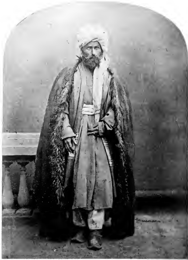
A KAKUR AFGHAN SOONNEE MUSSULMAN. SIND. 322.