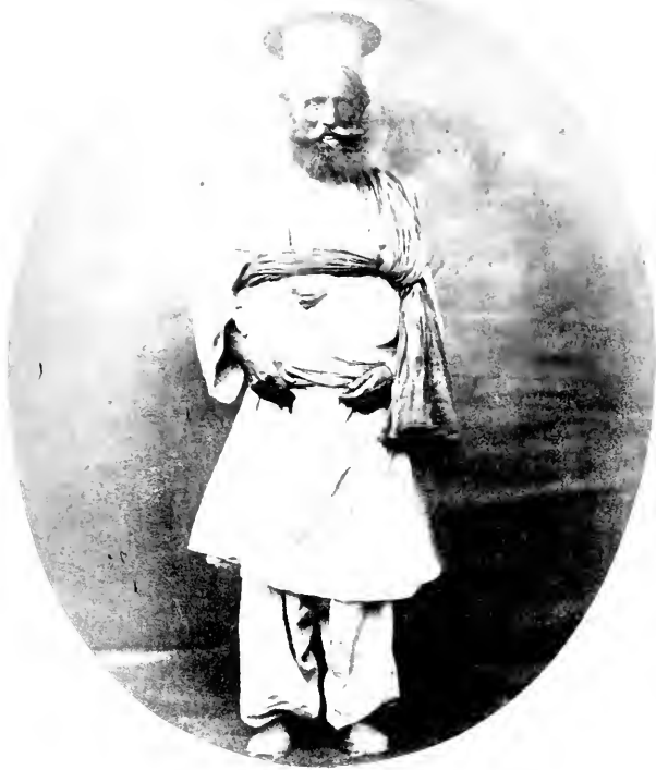
A BOORGAREE. BELOCH. SOONNEE MUSSULMAN. SIND. 297.