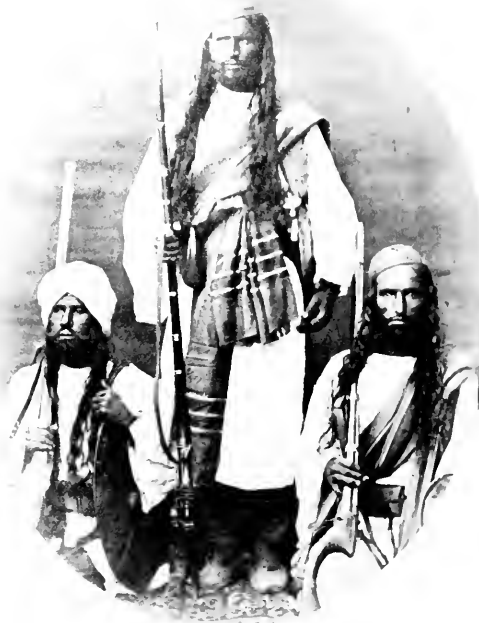
BRAHOOEES. INHABITANTS OF KHELAT STATE. SOONNEE MAHOMEDANS. SIND. 321.