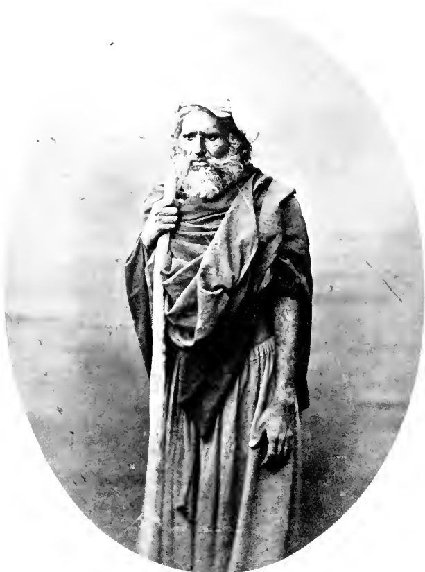
M H A R. DESERT TRIBE NEAR BHAWULPOOR. SOONNEE MUSSULMAN. S I N D. 317.