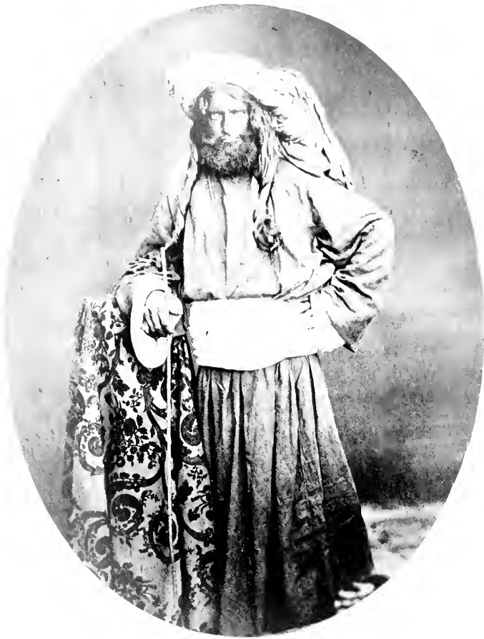
A GUDDRA. FROM LUS BEYLA. SOONNEE MUSSULMAN. SIND. 309.