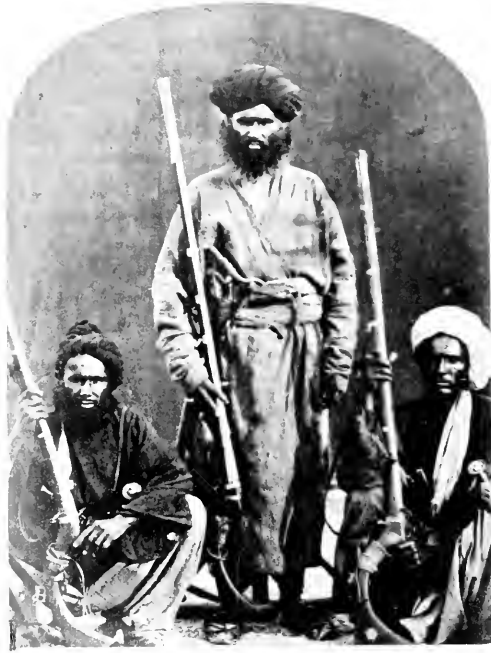
JOKYAS. MUSSULMANS. SIND. 313.