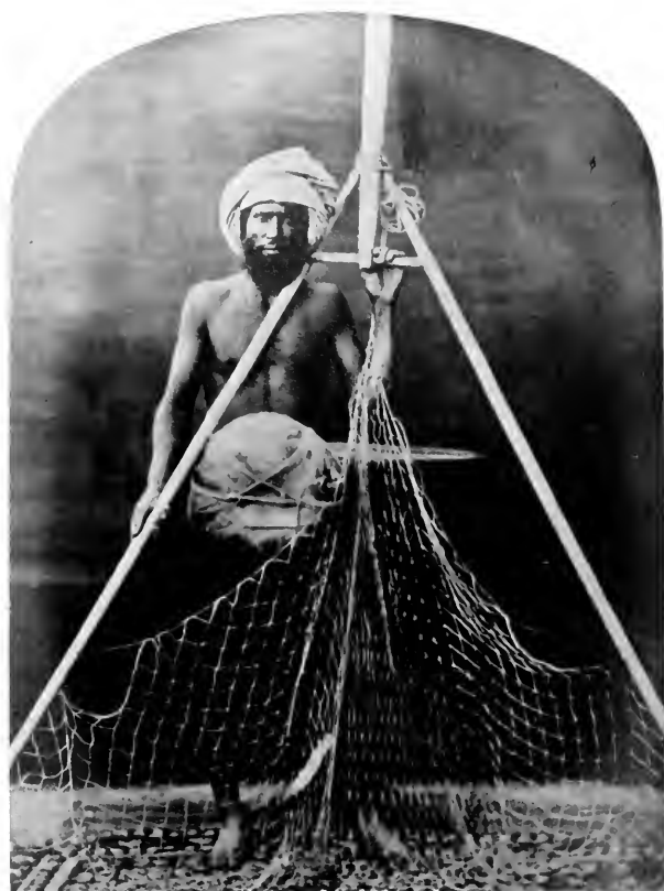
MOHANA FISHERMAN. SOONNEE MUSSULMAN. SIND. (337-2)