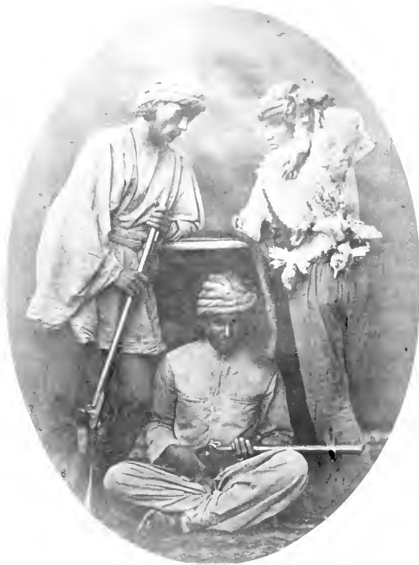
DAPHERS OR SHIKAREES HUNTSMEN AND SCAVENGERS. MUSSULMANS. SIND. 326.