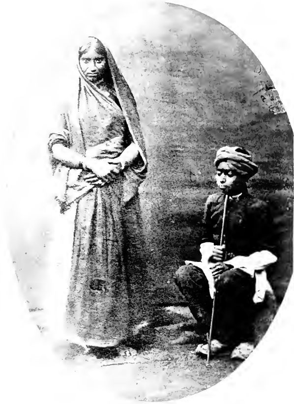
BABRAS. MERCHANT CLASS JAINS. SIND. 325.