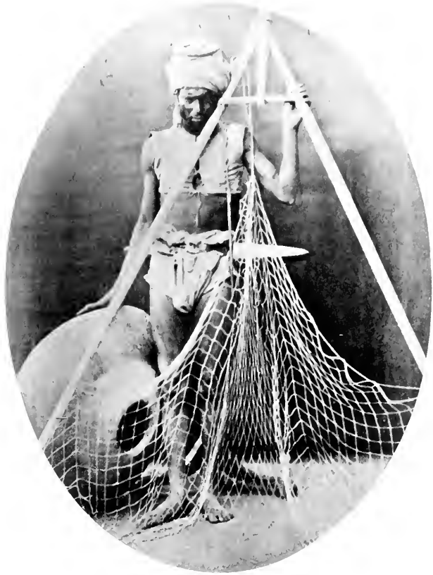
MOHANA FISHERMAN SOONNEE MUSSULMAN SIND. (337)