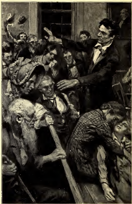
BUT LINCOLN STOOD GUARD