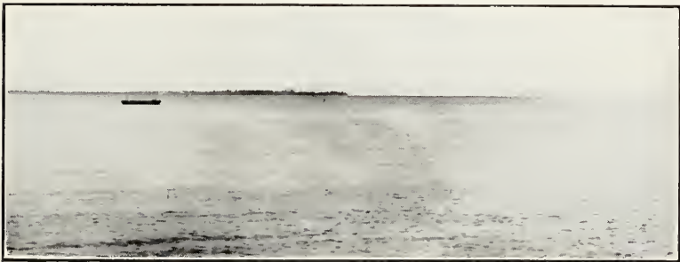
Lake Erie from the Site of the Perry Memorial.

A second consideration, pointing to a centennial observance educational and fraternal in the broadest sense, presented itself in the conclusion of the century of peace between English-speaking peoples that would be practically contemporaneous with the one hundredth anniversary of Perry's Victory; and from the inception of the centennial enterprise the opportunity of a union of British and American interests in the deepest significance of the proposed celebration, and in the dedication of a fitting permanent memorial, has been regarded by the commissioners of the participating states as the most appropriate and desirable object to be achieved by them in connection with the general project.