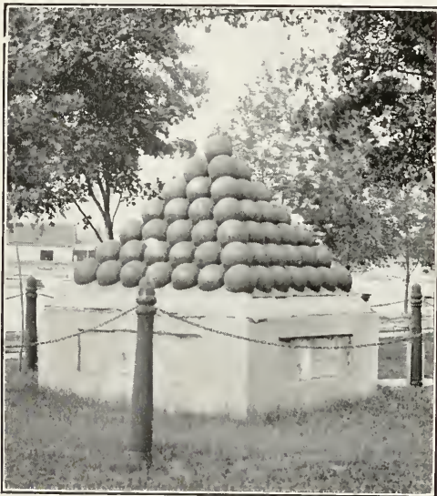
Pyramid of Cannon Balls on Put-in-Bay Island, marking the Graves of American and British Officers killed in the Battle of Lake Erie. This humble tribute, erected from the proceeds of an Amateur Theatrical Entertainment on the Island, is the only recognition which a grateful Nation has hitherto bestowed upon the sacrifices of these heroes.

that if England was the mistress of the sea, America was master. The fight off Put-in-Bay rescued the territory conquered by George Rogers Clark and wiped out the disgrace of Hull's surrender. Jones laid the cloth for the French alliance. Perry cleared the way for Harrison's advance and shortened the distance between Bladensburg and the Treaty of Ghent. But, above all, it was Perry, like Jones, who gave the world assurance of a man, of an American and of America, the resistless, the unconquerable; of the flag, the glorious, the wonder-breeding; of the Union, the imperishable. Over every frontispiece from the Aurora Borealis to the Southern Cross, over every temple of liberty and trade, over every arena of manly prowess and productive achievement, blazing in letters of living light, as Webster would have said, shine forever the letters that spell the words, "We have met the enemy and they are ours."