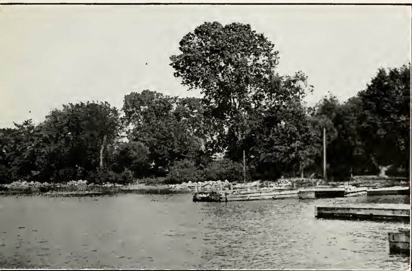
THE SITE OF THE PERRY MEMORIAL.

missioner Nelson A. Miles and First Vice-President-General Henry Watterson, with the Secretary-General of the Inter-State Board as Secretary.