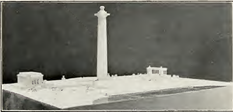
Photograph from a Model of the Perry Memorial by Menconi Brothers of New York.

The centennial fleet, escorting the restored "Niagara," will visit in rotation all the ports of the Great Lakes joining in the series of celebrations during the summer of 1913. The same marine pageants and the same military ceremonies may be produced in each city, accompanied by such local ceremonies and additional attractions as may be determined upon by the different communities. In this manner, where one city for a single celebration might raise a fund of $50,000 or $100,000 for the objects in view, each city uniting with its sister city, as is here indicated, would have the benefit of the spectacles presented by an organization representing an investment of from $200,000 to $400,000.