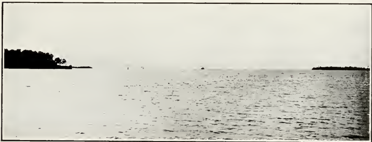
Looking toward the Scene of the Battle of Lake Erie from the Site of the Perry Memorial.

The brief but glorious story of the conflict that ensued is known to every schoolboy. The Americans had the advantage in the number of their vessels; the British, in the number and carrying power of their guns and a slight numerical superiority of seamen and officers. The "Lawrence," Perry's flagship, was soon put out of commission by the long range fire of the enemy, leaving only 18 out of her 101 officers and men not dead or disabled. From this bloody wreck the dauntless Perry removed his flag, in a small boat under heavy fire, to the "Niagara"—the most perilous half-mile dash in the history of naval warfare. Bringing all his remaining fleet in action, the young American commander passed through the line of the enemy with successive broadsides at short range, and in the brief space of thirty minutes compelled the surrender of his entire force.