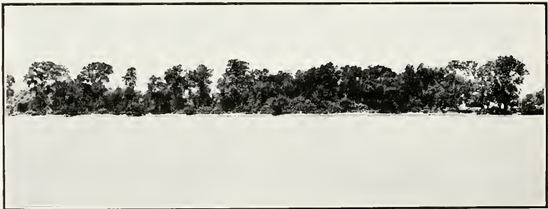
Lake Erie Shore Line of the Site of the Perry Memorial.

The military aspect of the celebration, from an historical standpoint, will take due cognizance of General Harrison's march through Ohio to the Lakes, his encampment on the present site of Fremont, his embarkation on board Perry's fleet, his sojourn at Put-in-Bay, his entrance into Michigan, his liberation of Detroit and his invasion of Canada, culminating in the crowning success of his campaign at the Battle of the Thames. The present physical boundaries of all the states bordering on the Great Lakes