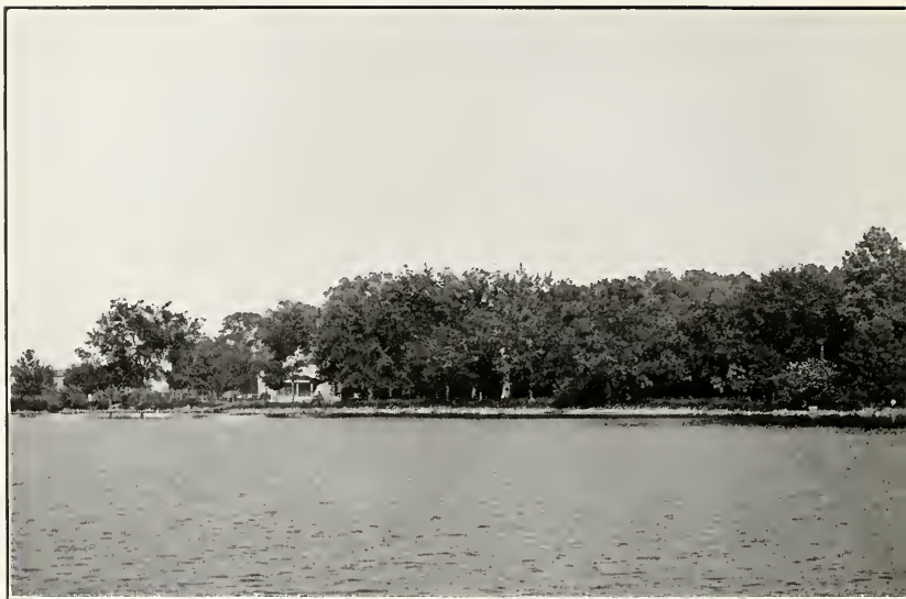
PUT-IN-BAY HARBOR SHORE LINE OF

including 1912, were as follows: Ohio, $83,000; Pennsylvania, $75,000; Wisconsin, $50,000; Rhode Island, $25,000; and Kentucky, $25,000, making a total available from all sources of $508,000.