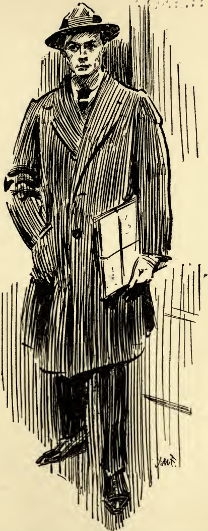
“ He made straight for the main desk with its battalion of clerks ”— Page 119