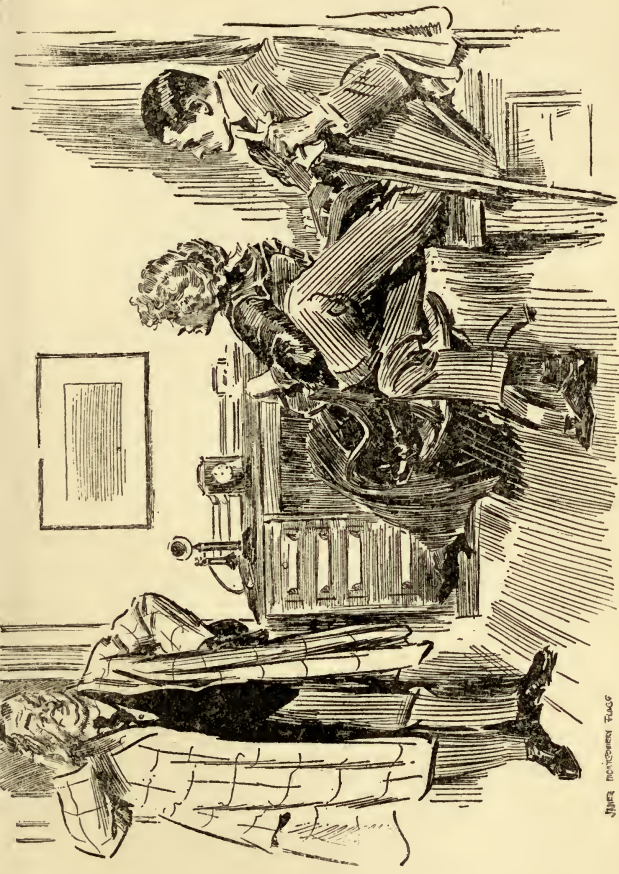
“ ‘Greetings!’ ” — Page 68