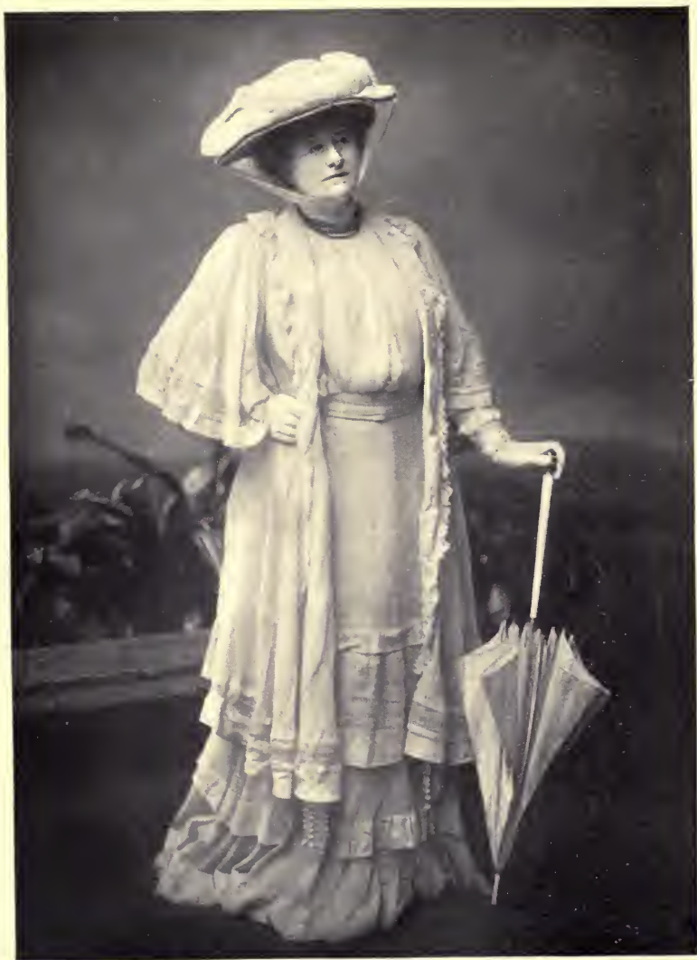
MISS ELLEN TERRY, 1906