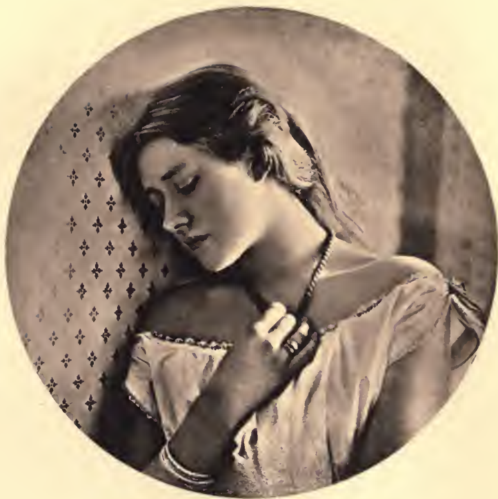
Ellen Terry, age 17. Photograph taken by M rs Julia Margaret Cameron, at Freshwater in 1865.