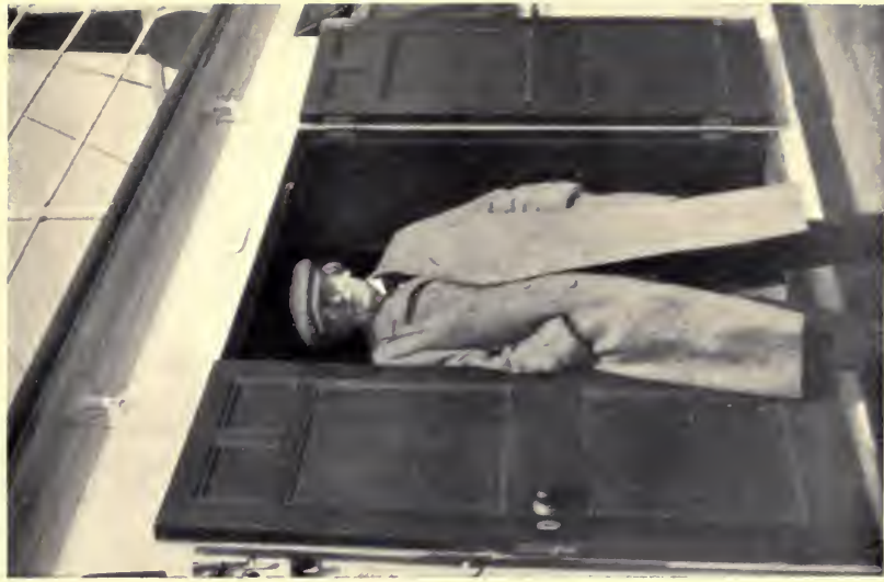
HENRY IRVING ON SHIPBOARD