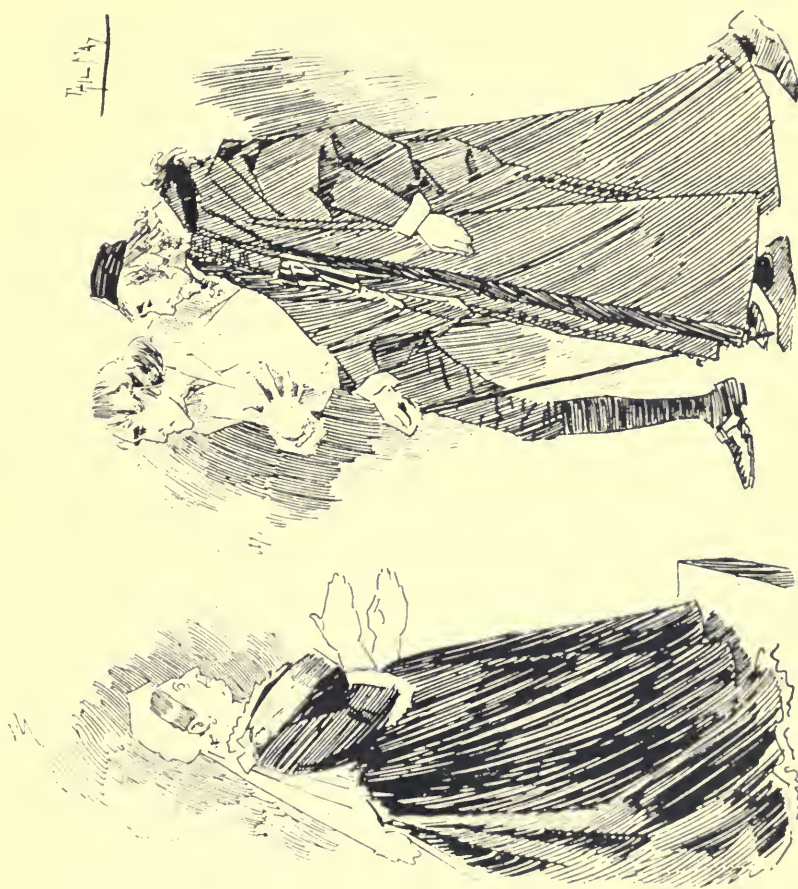
MATHIAS AND SHYLOCK PRESENTED TO HER MAJESTY AT SANDRINGHAM, 1889