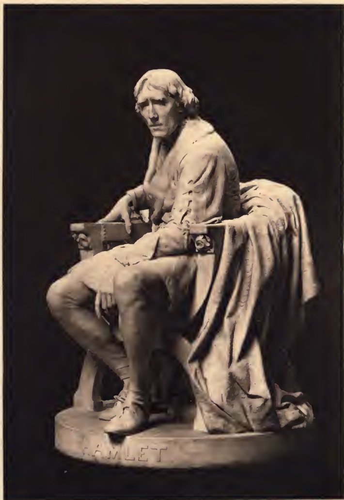
Henry Irving as Hamlet. Marble Statue by E. Onslow Ford, in the Guildhall.