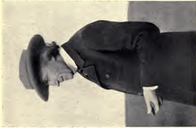
HENRY IRVING, 1905