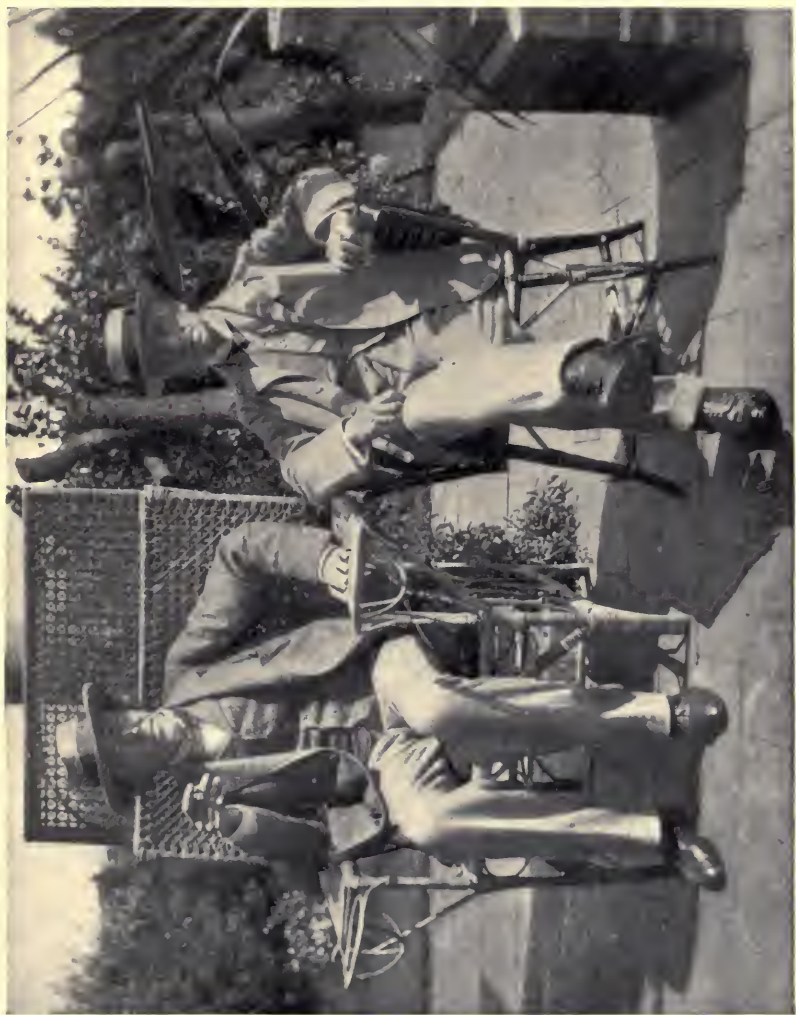
HENRY IRVING AND JOHN HARE