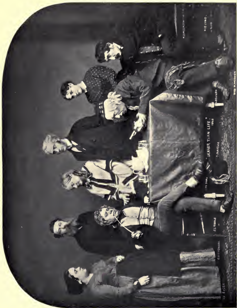
THE CAST OF "DEAREST THAN LIFE," 1868