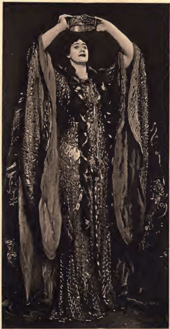
Ellen Terry as Lady Macbeth. from the painting by John Sargent, R.A., in the Tate Gallery.