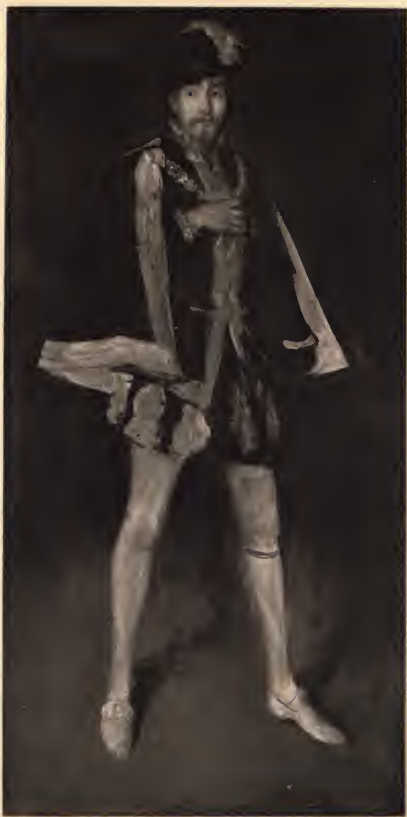
Henry Irving as Philip II. in Tennyson's Queen Mary. painted by James McNeill Whistler