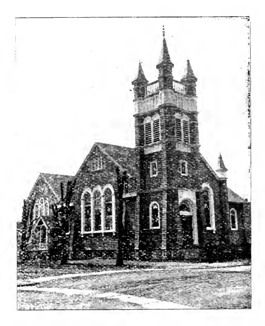
St. Mark's English Lutheran Church