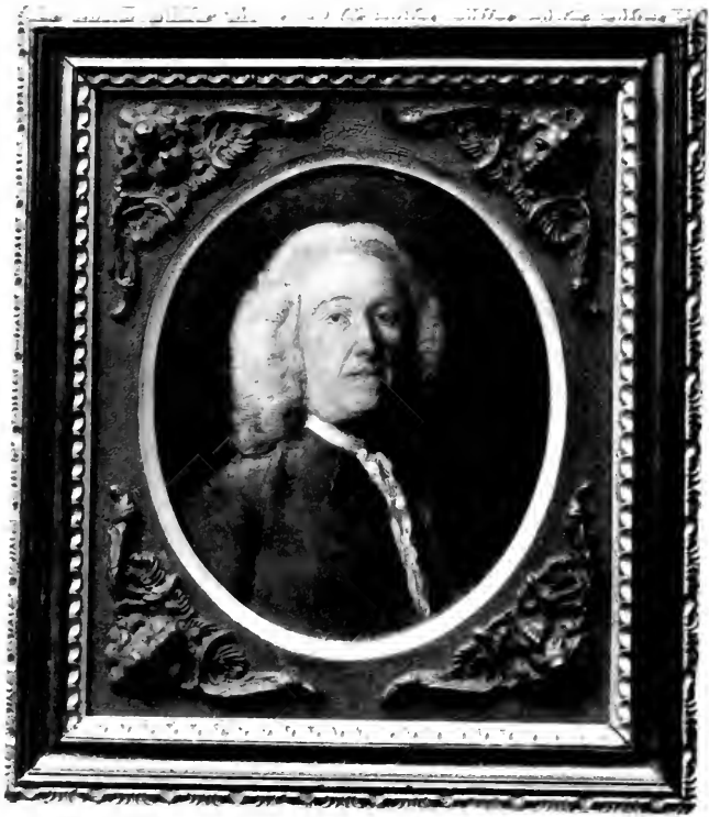
PETER OLIVER, CHIEF JUSTICE OF MASSACHUSETTS.