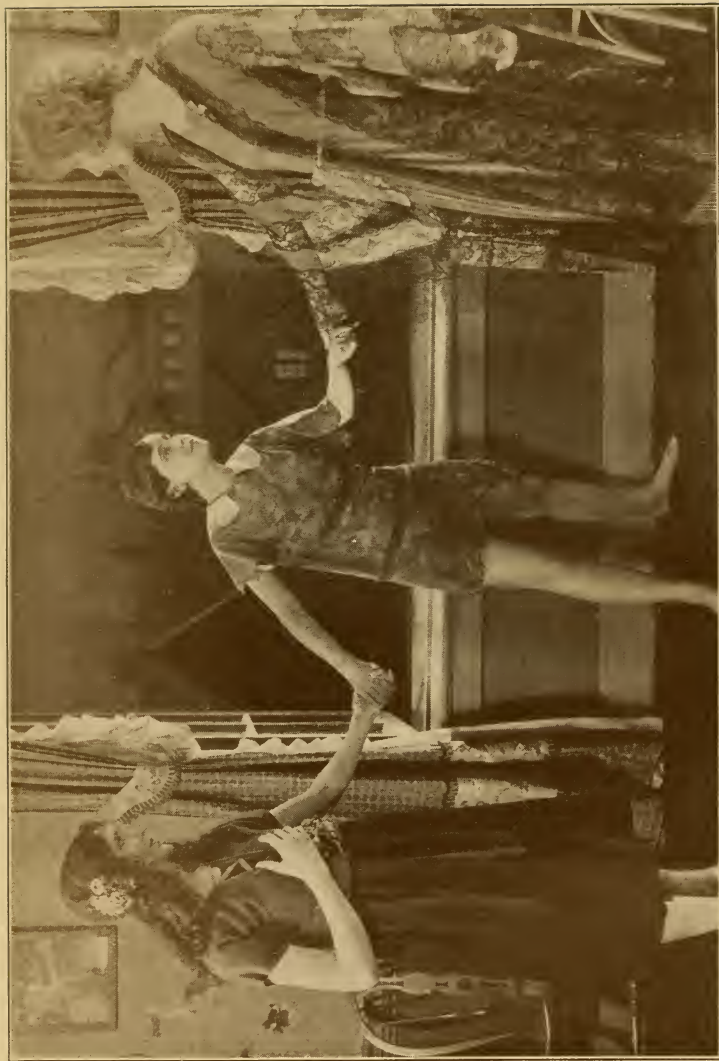
A Paramount Picture.

Peter and Wendy—Photoplay title "Peter Pan," PETER SAYING GOOD-BYE TO WENDY AND MRS. DARLING.