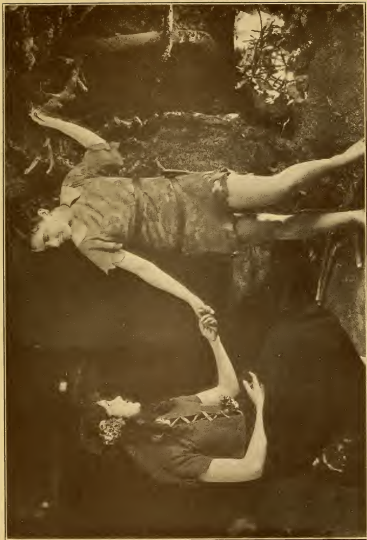
A Paramount Picture.

Peter and Wendy - Photoplay title "Peter Pan," "PETER, WHAT ARE YOU TO ME?"