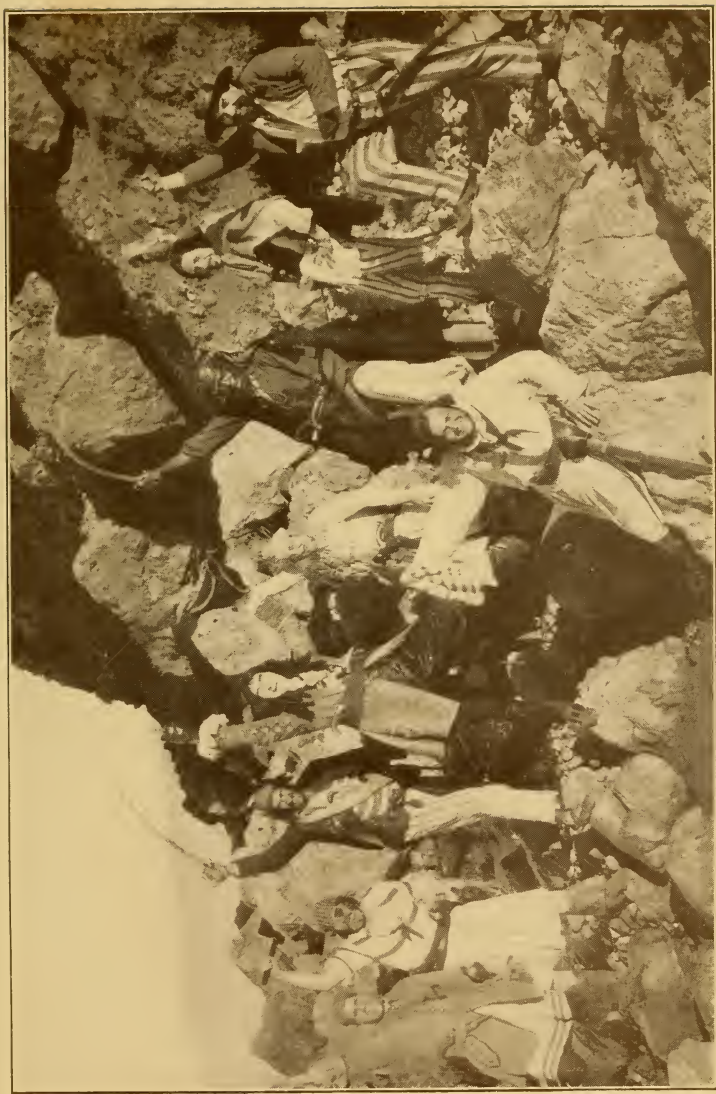
A Paramount Picture. CAPTAIN HOOK AND HIS BAND OF PIRATES ON THE SHORES OF NEVERLAND. Peter and Wendy—Photoplay title "Peter Pan."