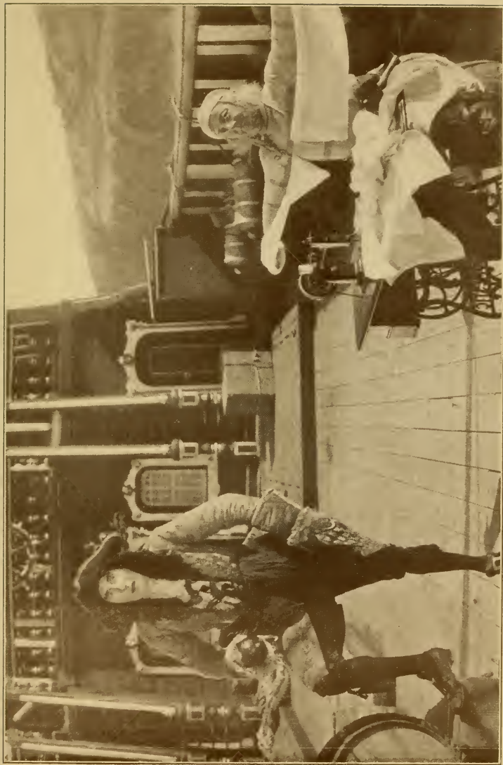
A Paramount Picture.

CAPTAIN HOOK THINKS HE HAS TORN HIS BREECHES WHEN SNEE TEARS SOME CLOTH.