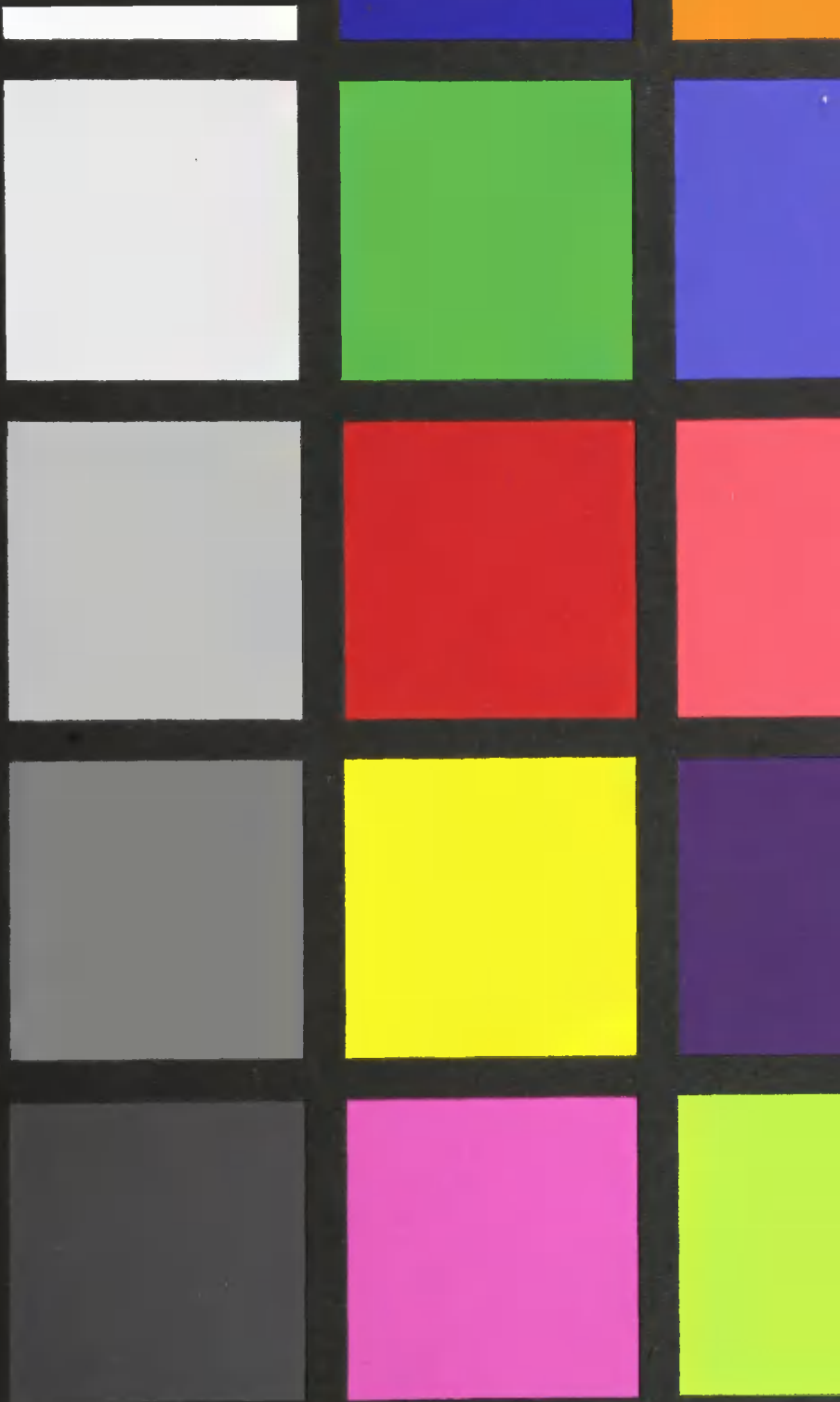
GretagMachbeth™ ColorChecker Color Rendition Chart