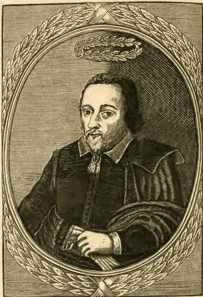
Vera ac Viva Effigies PHILIPPI MASSINGER