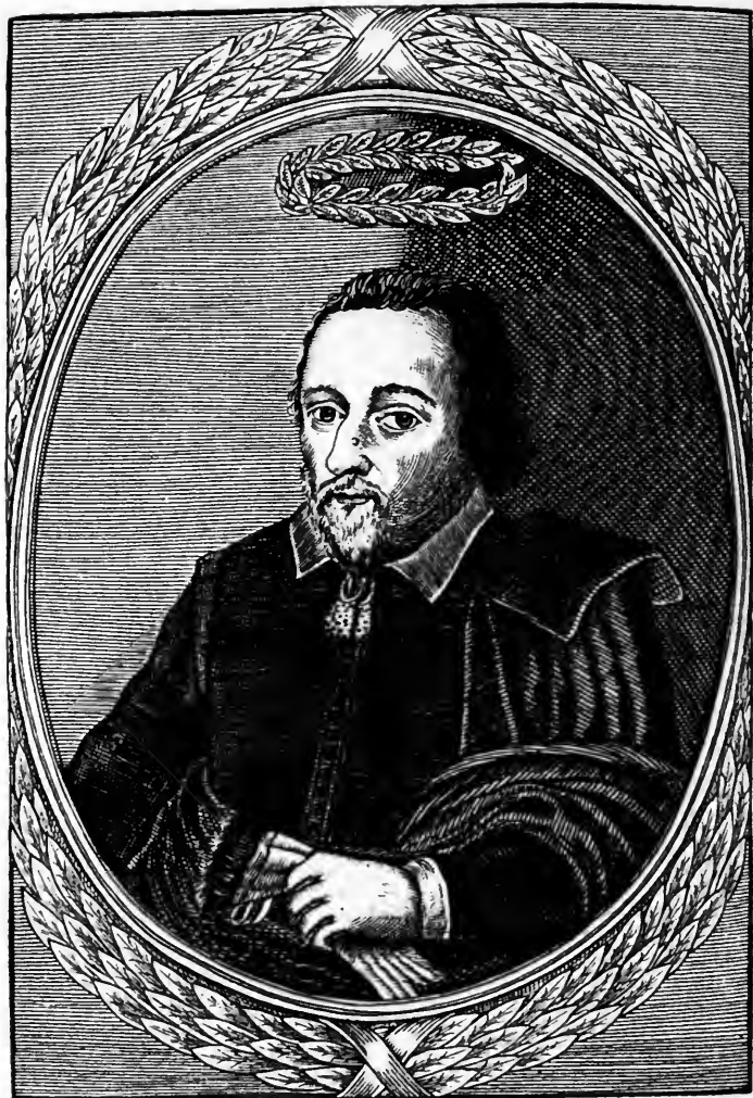
Vera ac Viva Effigies PHILIPPI MASSINGER. Gen d