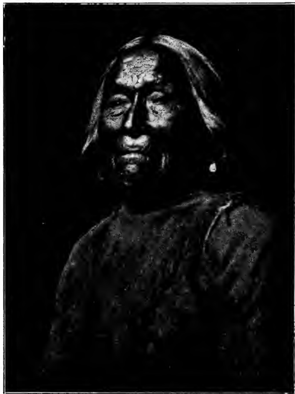
Old Apache Scout