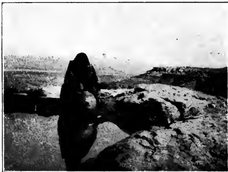
Hopi maiden at the pool