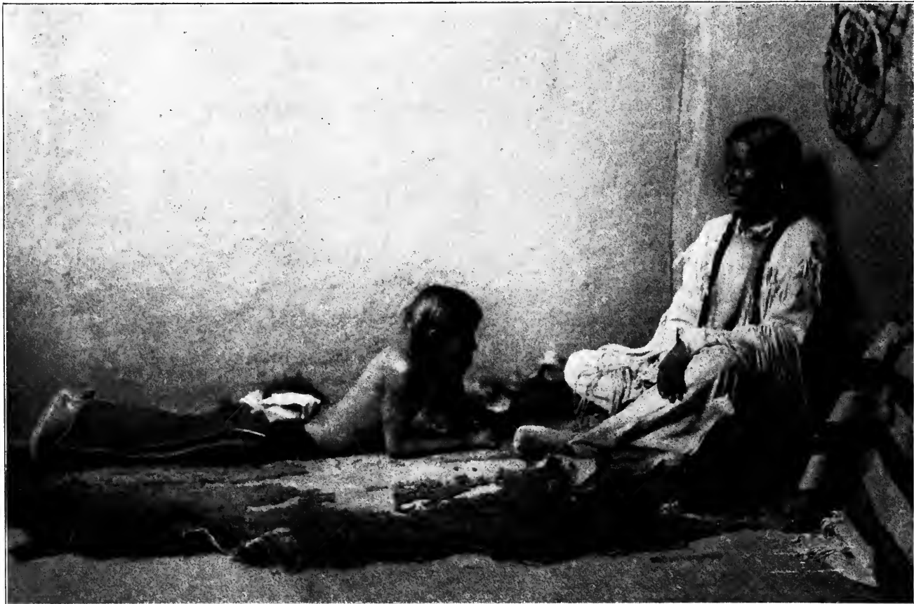
Old man telling a little boy a tribal legend