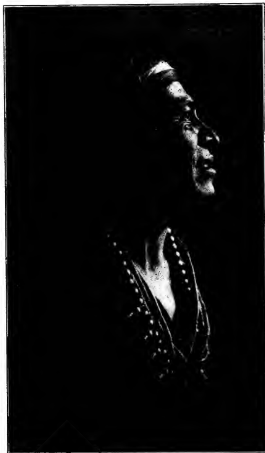
Navaho medicine man