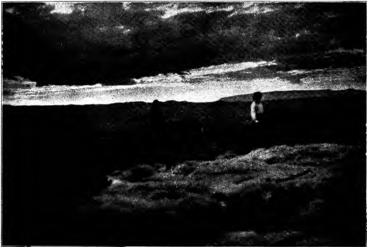
Sunrise from the Cliffs of Acoma