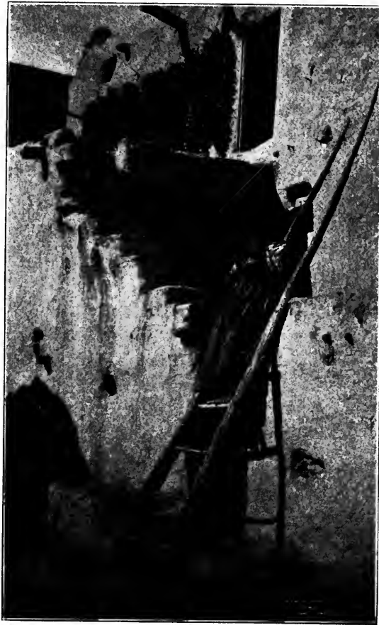
Showing early style of architecture