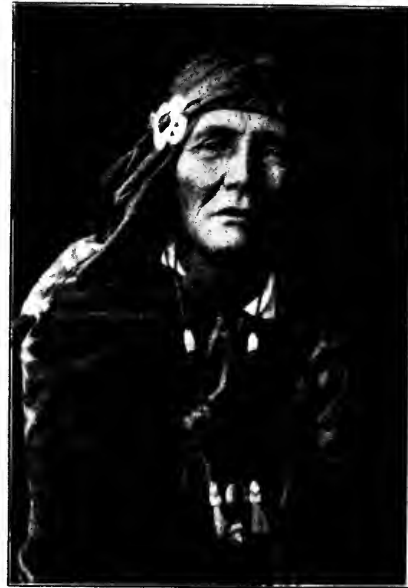
Chief of White Mountain Apaches