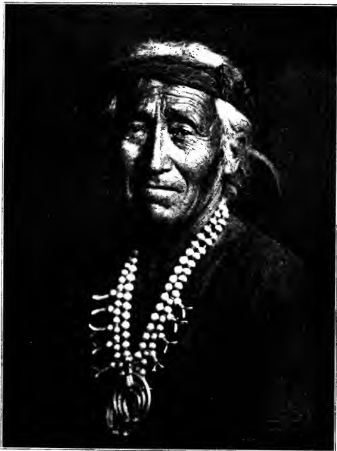
Old Navaho medicine man