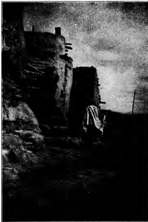
An odd corner in a Hopi village