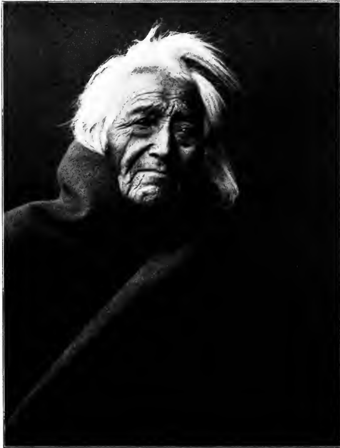
A White Mountain Apache