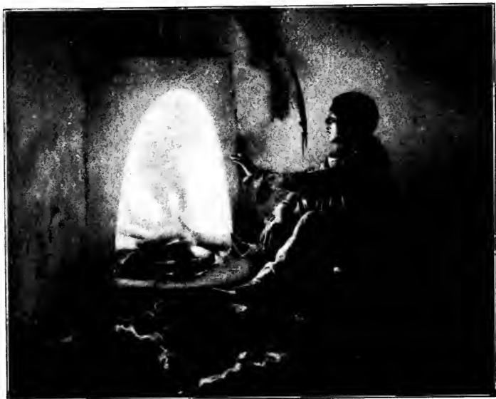
Taos hunter at the close of day