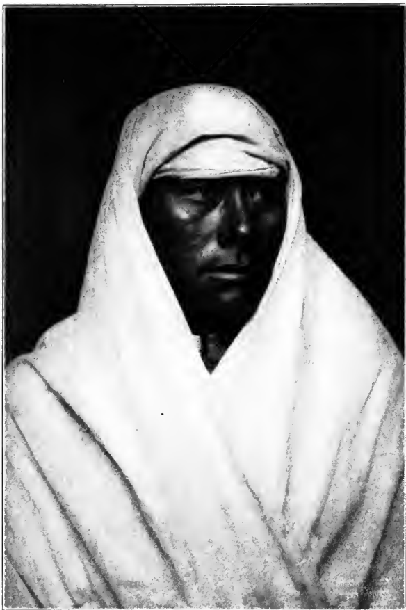
An American Arab