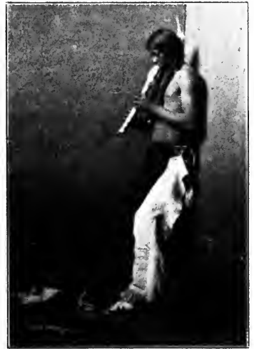
A Taos flute boy practising before the dance