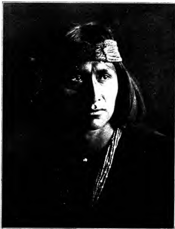
Representative Navaho youth