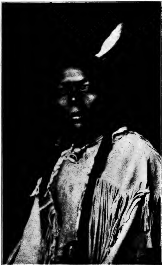
A typical Taos Indian