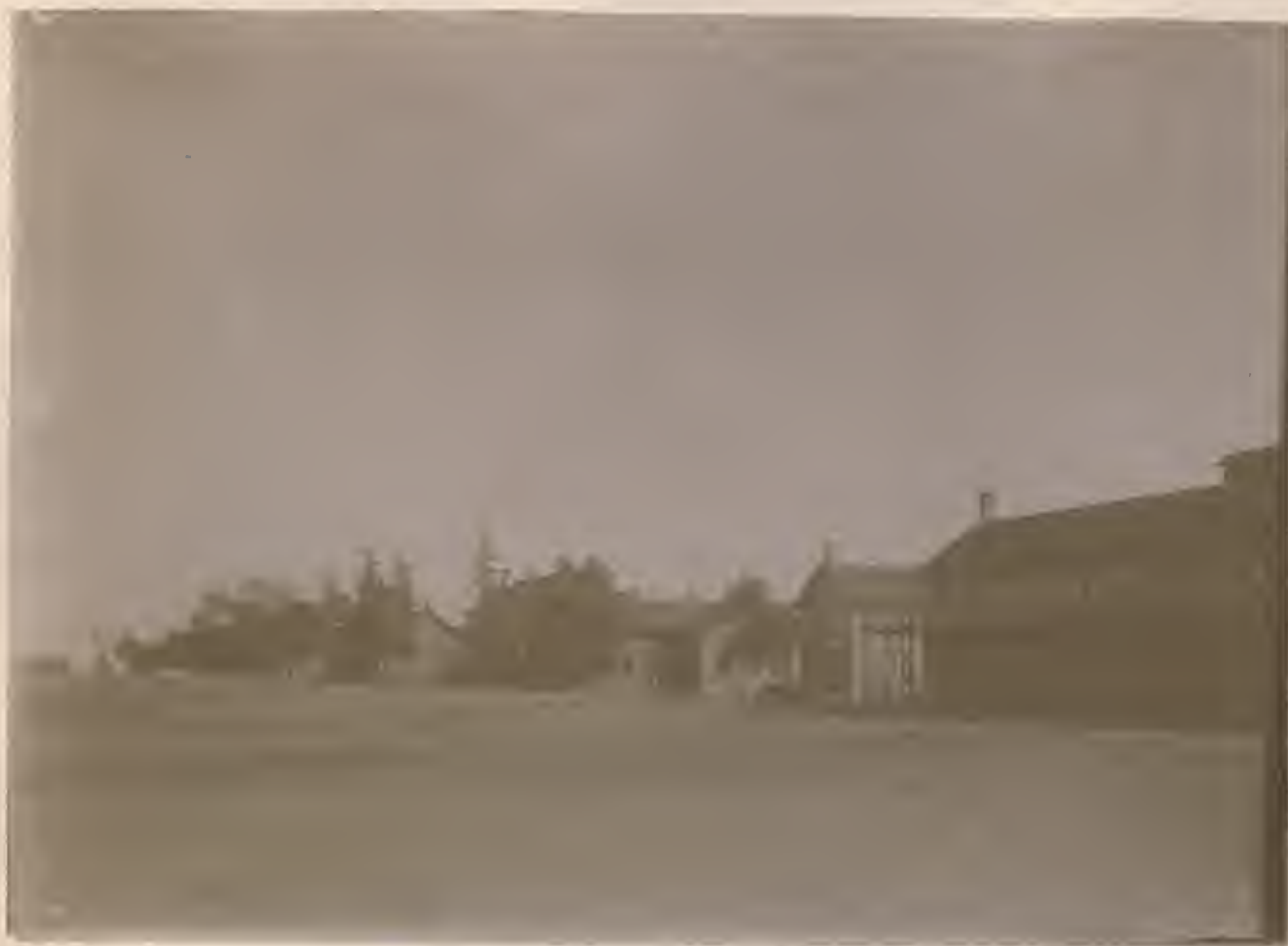
Bird's-Eye View of Vancouver Barracks.