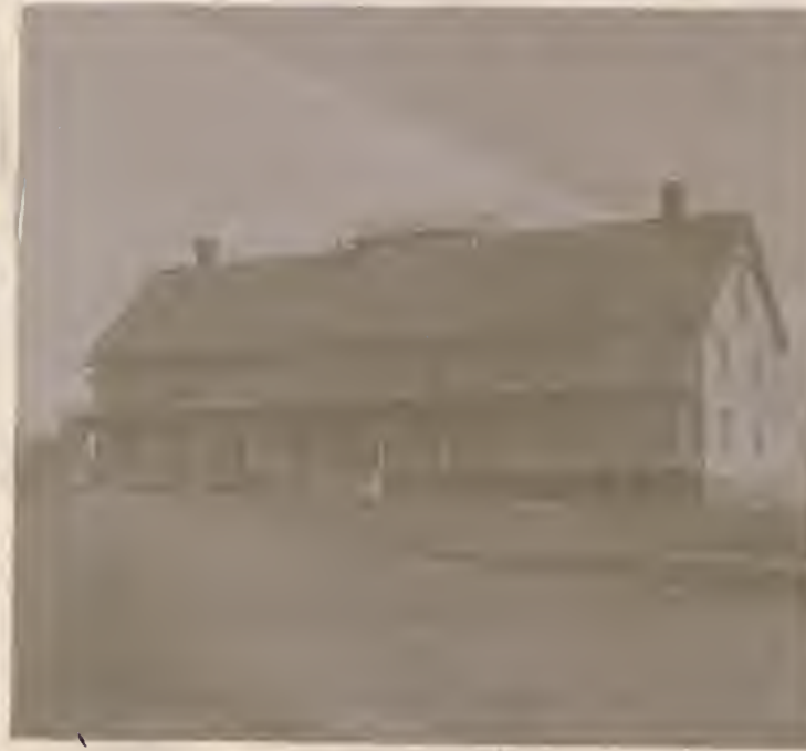
Barracks of Co. "H."