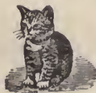
♣ MASCOT ♣