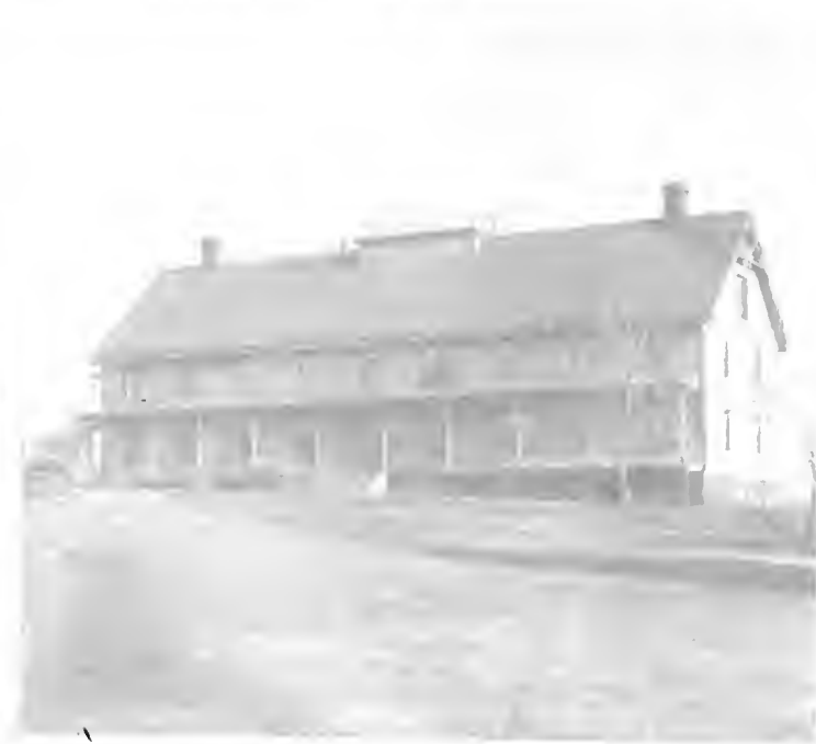
Barracks of Co. "H."