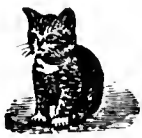
▷ MASCOT ◁