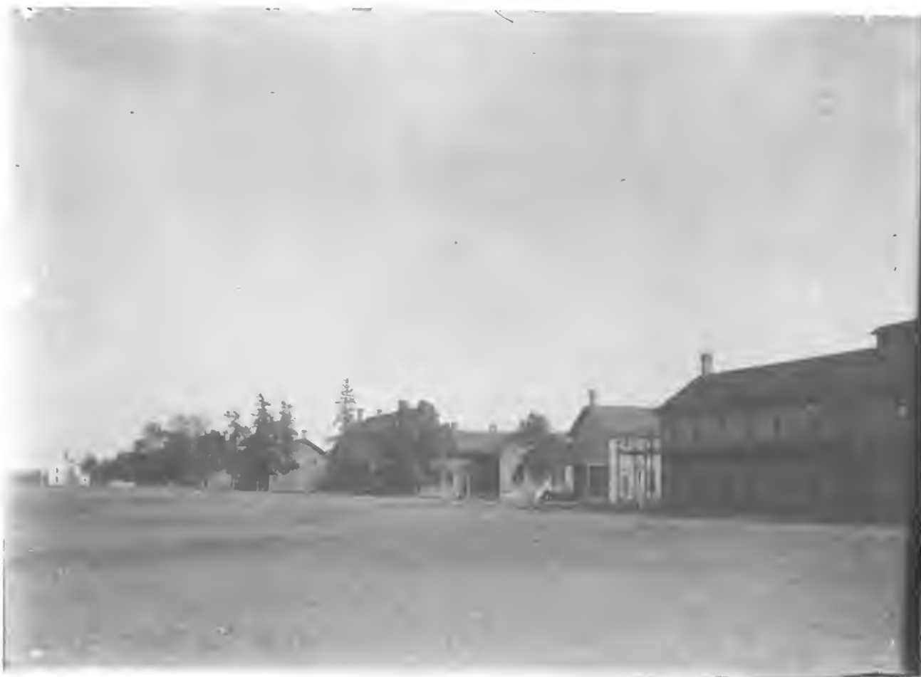
Bird's-Eye View of Vancouver Barracks.