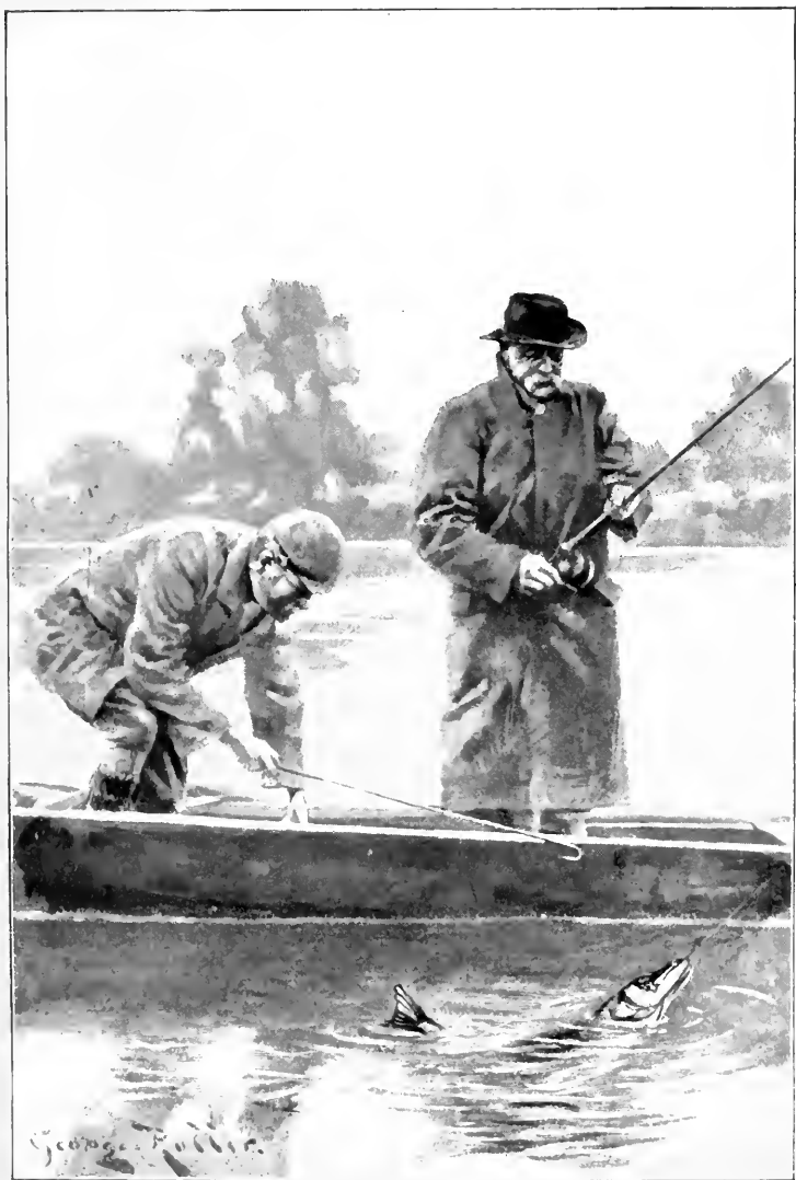
READY FOR GAFFING