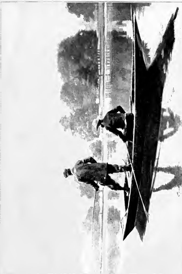
TYPICAL ENGLISH PARK WATER