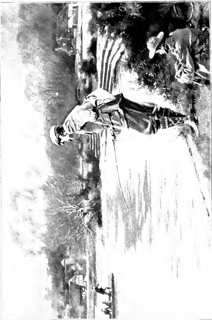
A PERFECT SPIN