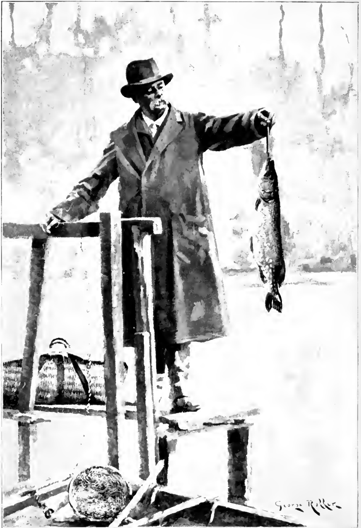
JUST TEN POUNDS