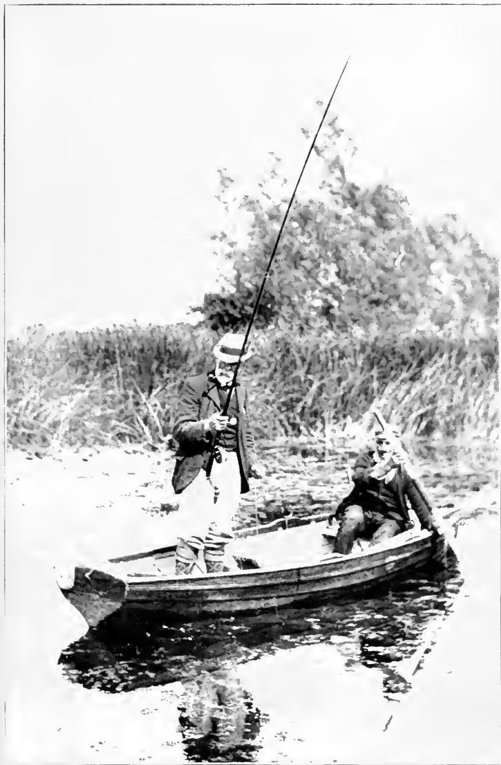
PATERNOSTERING FOR PERCH