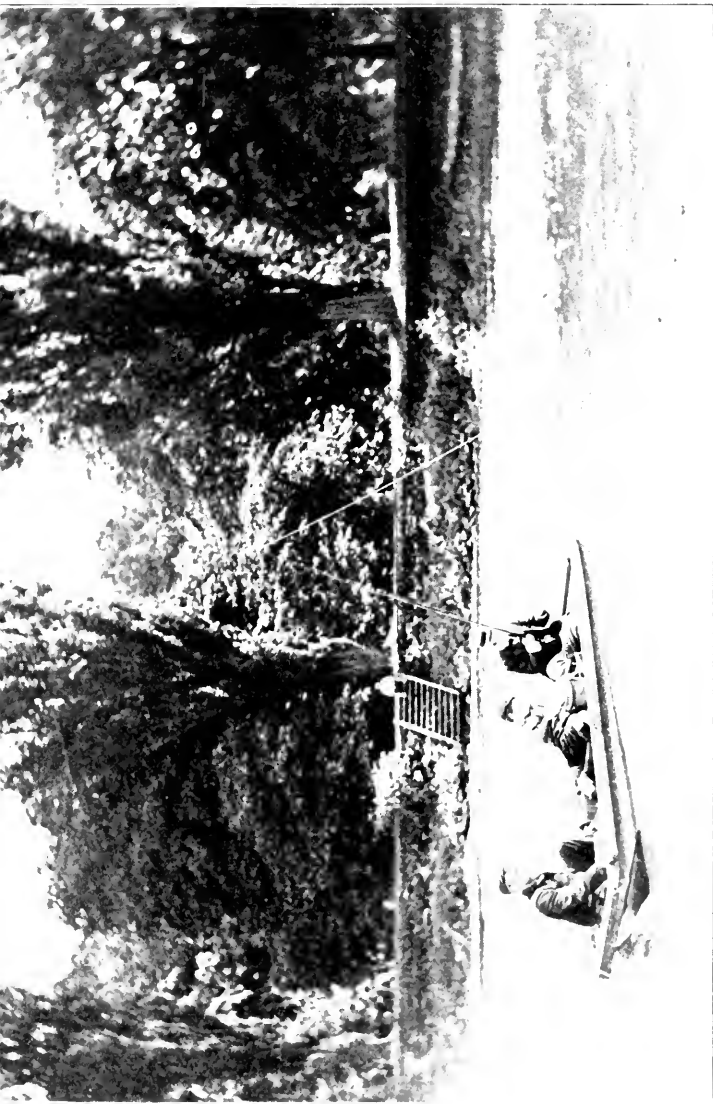
A FAVOURITE PIKE SWIM