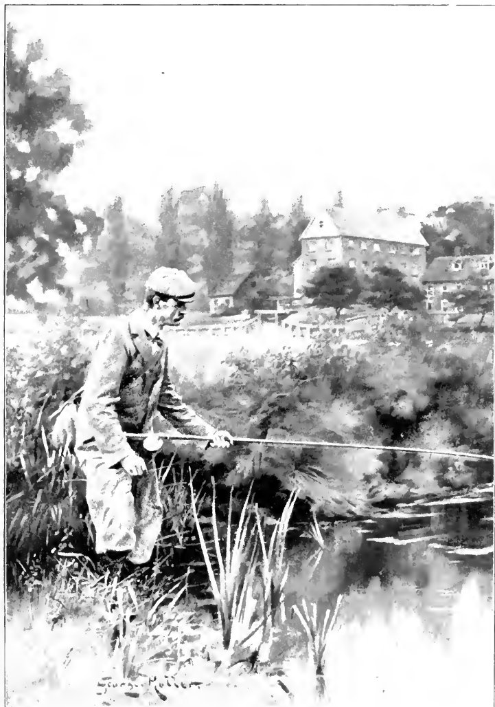
A FAMOUS PERCH FISH