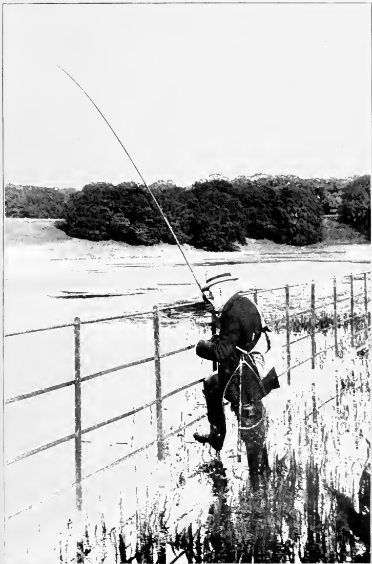
AN AWKWARD PEEPER