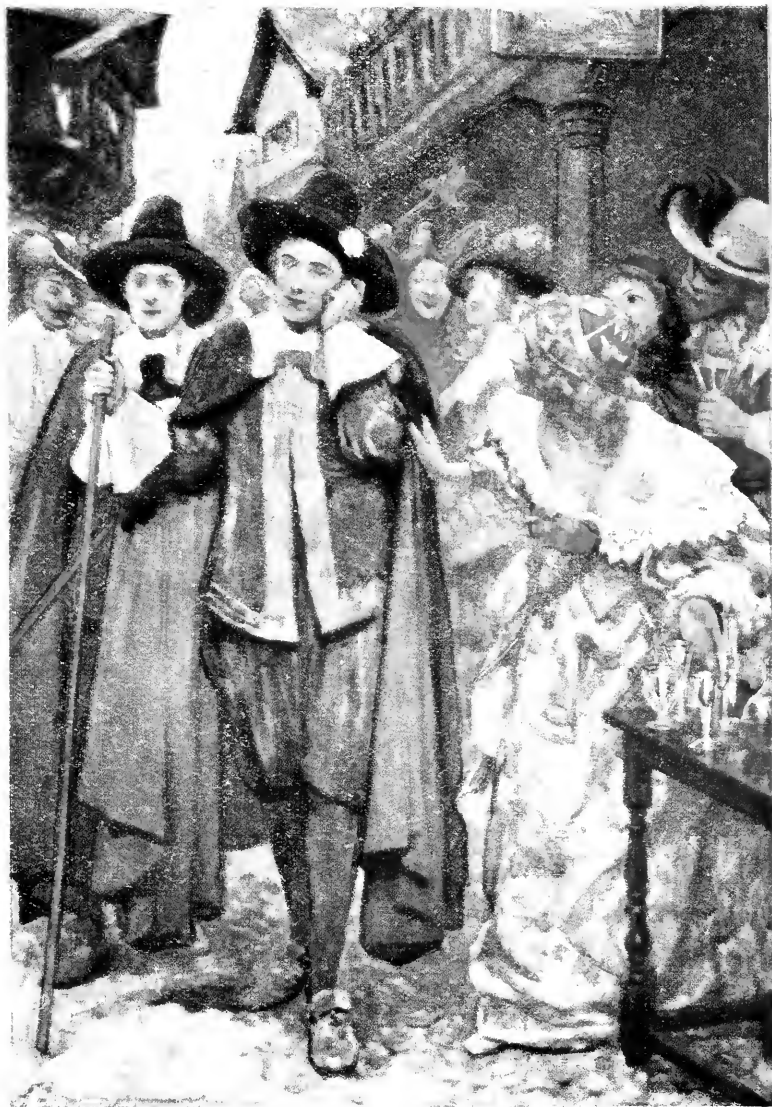
CHRISTIAN AND FAITHFUL IN VANITY FAIR.