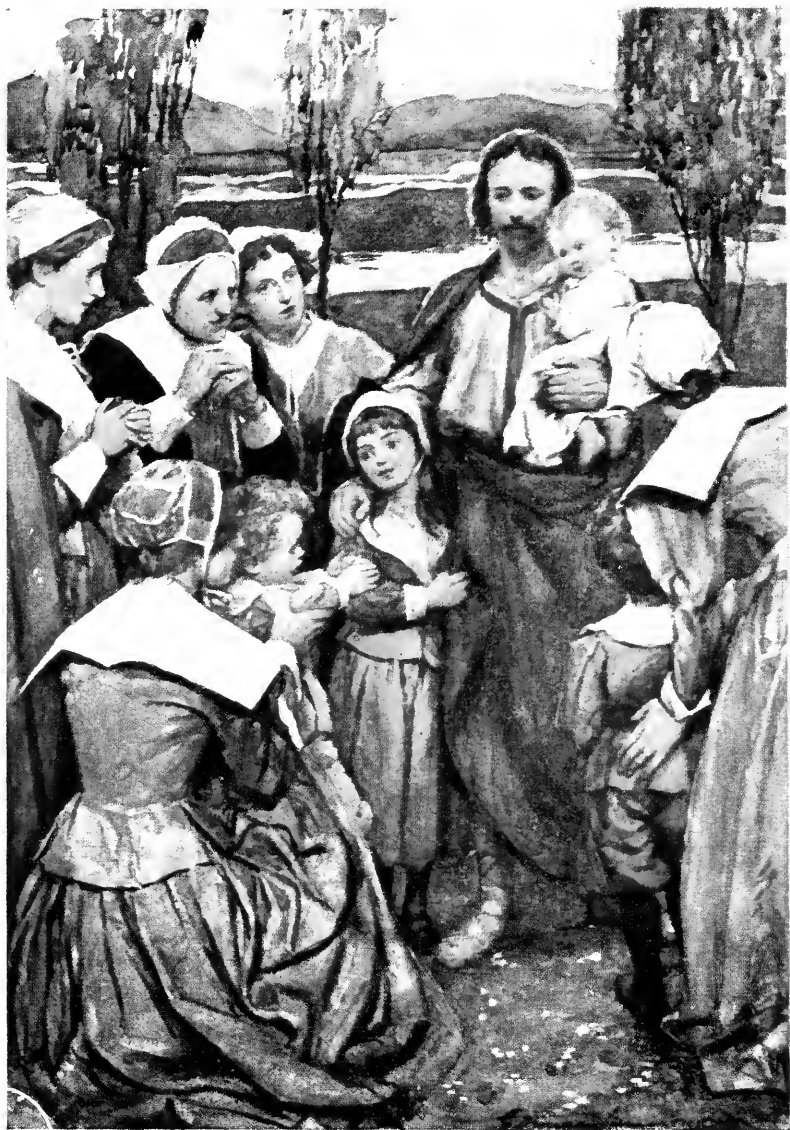
ONE THAT WAS ENTRUSTED WITH THE CHILDREN.