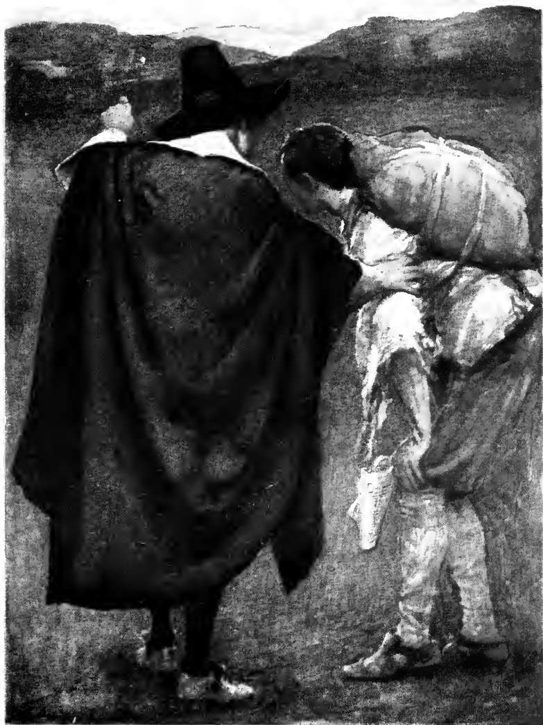
EVANGELIST DIRECTS CHRISTIAN TO THE WICKED GATE.