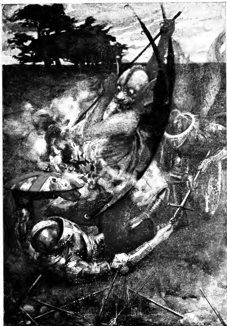
APOLLYON GIVES CHRISTIAN A DRI ADEL TAIL