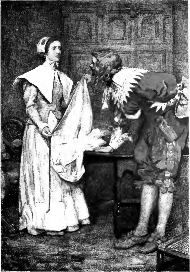
MERCY AND HER VISITOR