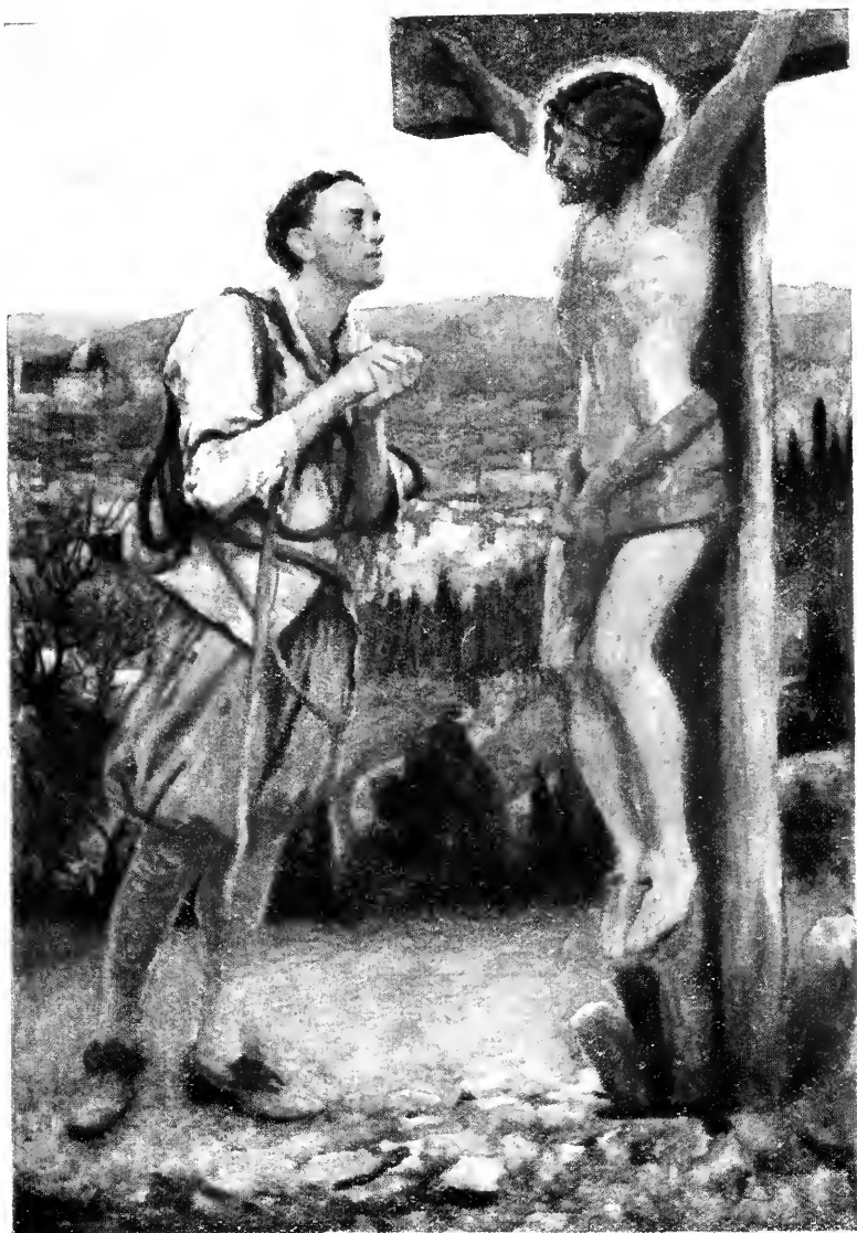
CHRISTIAN LOSES HIS BURDEN AT THE CROSS.