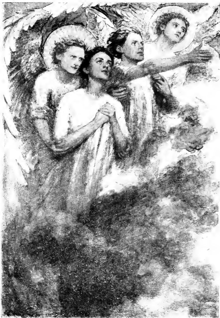
CHRISTIAN AND HOPEFUL ARE CARRIED UP TO THE HOLY CITY.