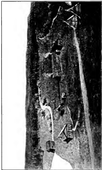
HOME OF DR. MARCUS WHITMAN AT WAILLATPU AND SCENE OF THE MASSACRE