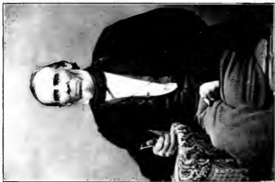
J. Q. THORNTON

Judge of the Provisional Supreme Court, who made the mission to Wash- ington in 1848.