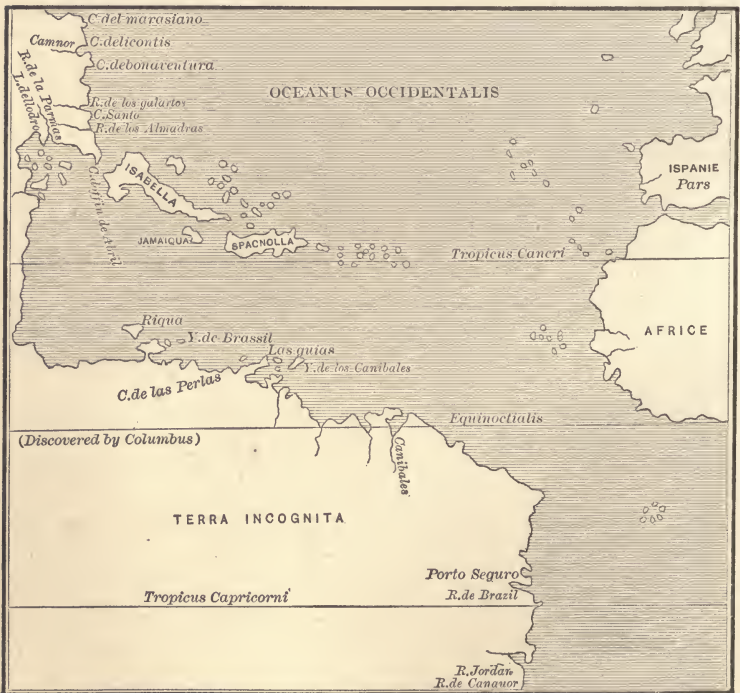
MAP FROM PTOLEMY, 1513.