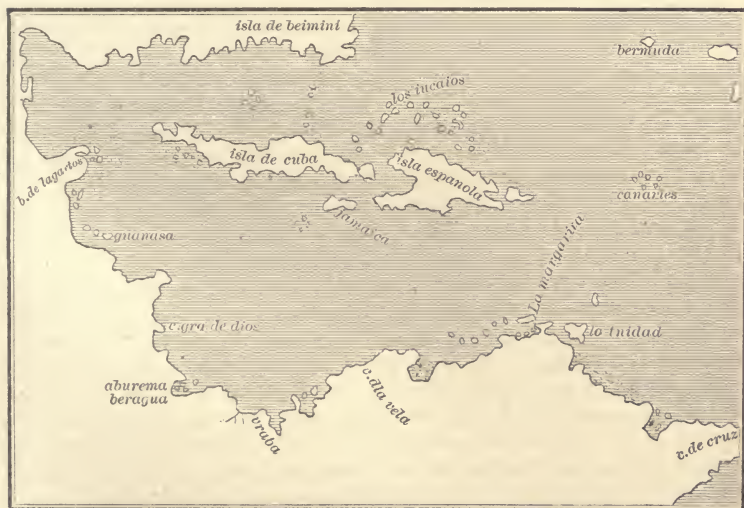
PETER MARTYR'S MAP, 1511.