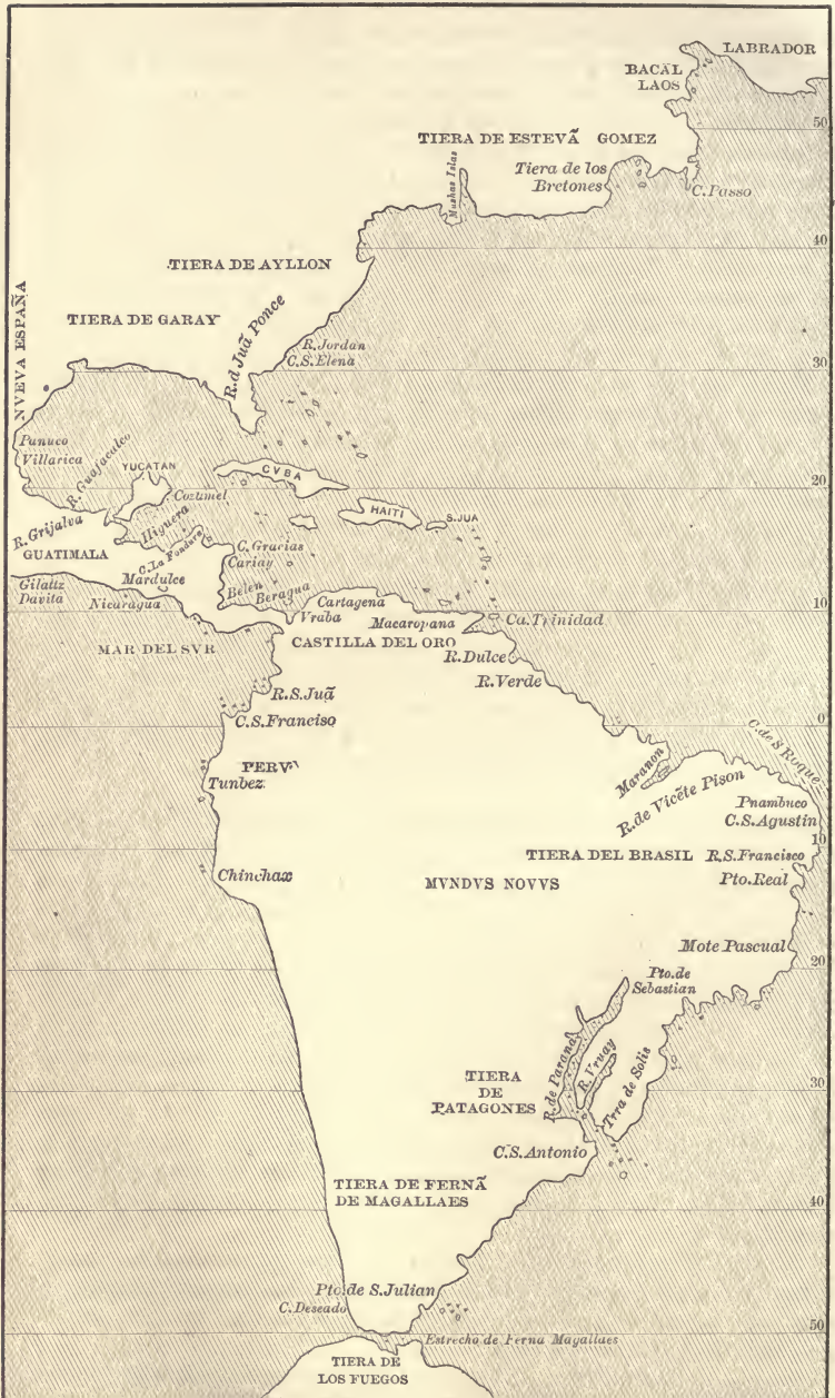
DIEGO RIBERO'S MAP, 1529.