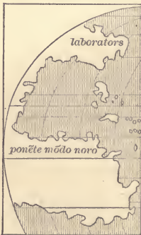
MAP BY BENEDETTO BORDONE, 1528.

[1528.] Bordone, Libro di Benedetto Bordone Nel qual si ragiona de tutte l'Isole del mondo , Vinegia, 1528, gives maps of the larger American islands, and also a map of the world, the American part of which I copy from the original. No part of the western coast is shown, although the New World is represented as distinct from Asia.