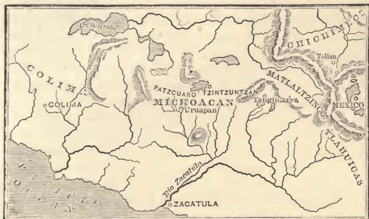
MICHOACAN AND COLIMA.

arrival of more friars, 6 conversion spread, and hermitages and convents were soon established in different towns, as Guayangareo, Patzcuaro, Acámbaro, Uruapan, and Tarécuaro, all of which were subordinated to the mother institution at Tzintzuntzan, a city confirmed as capital by decree of 1528. 7