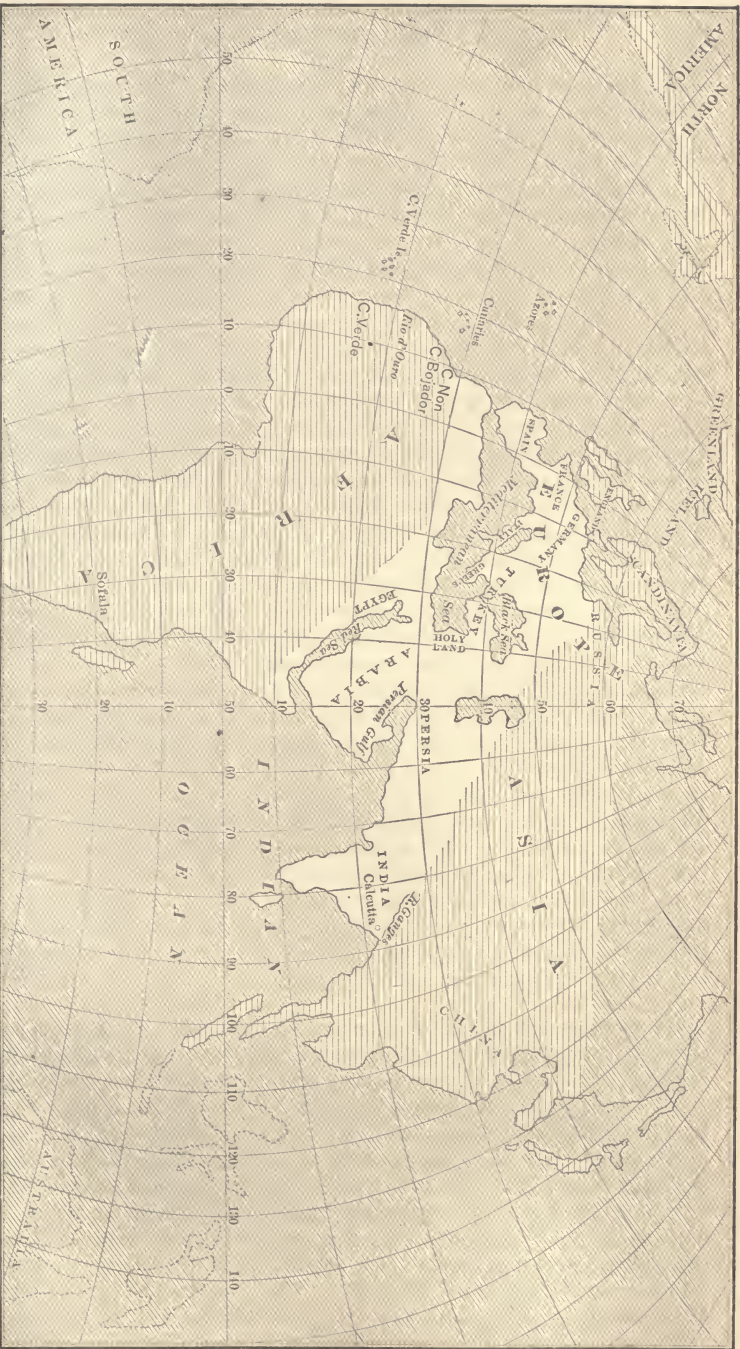
THE WORLD; THE WHITE PART AS KNOWN AT THE END OF THE FOURTH CENTURY, THE LIGHTLY SHADED PORTIONS AS KNOWN AT THE END OF THE FIFTEENTH.