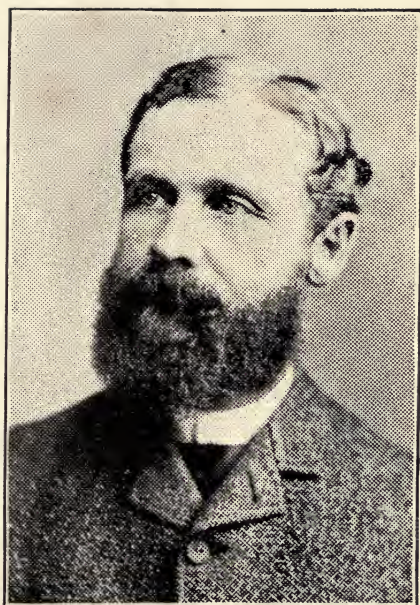
HENRY LEBBEUS OAK