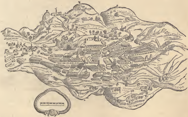
CITY OF ZACATECAS.

to the Spaniards. The soil was little adapted to the cultivation of wheat, maize, or even fruit, excepting the Indian fig, the cactus apuntia covering the neighborhood in every direction. Nevertheless its location had many advantages. The climate, though changeable, was healthy, being never excessively hot or cold. In the vicinity variety of temperature favored the cultivation of different agricultural products. Cattle-raising became an important feature at an early day, and besides silver, copper lead and other metals were found in abundance. 22