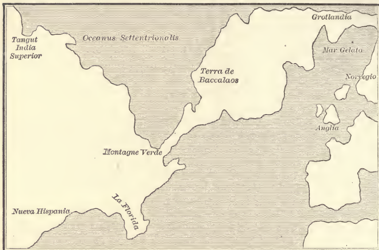
RUSCELLI'S MAP, 1544.

under the name of geography. Scores of additional examples might be given.