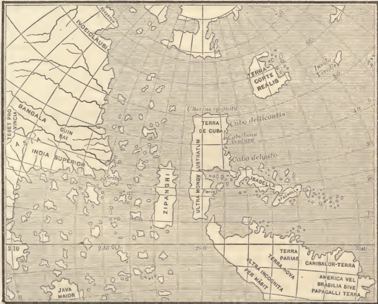
SCHÖNER'S GLOBE, 1520.

A globe made by John Schöner in 1520 is preserved in Nuremberg, and copies have been given by Ghillany, Lelewel, and Kohl, of which I give a reduction.