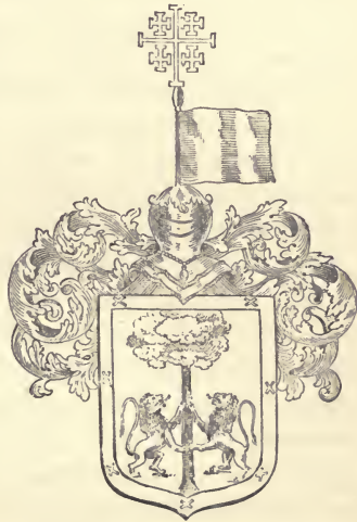
COAT OF ARMS OF THE CITY OF GUADALAJARA.