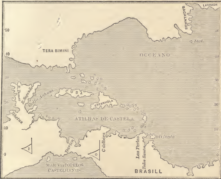
MAP IN MUNICH ATLAS, SUPPOSED TO HAVE BEEN DRAWN ABOUT 1518.

maps; as for example the United States coast from Newfoundland (Bacalnos) to Florida (Bimini), and the Gulf coast from Florida to Yucatan. In the central region the names 'Terram Antipodum' and 'Antilhas de Castela' are used without any means of deciding to exactly what parts they are to be applied. The South Sea discovered by Balboa in 1513 is here shown for the first time with the inscription 'Mar visto pelos Castelhanus.' To South America the name 'Brasill' is given. The presence of two Mahometan flags in locations