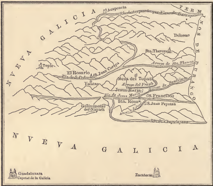
ANCIENT MAP OF NAYARIT.