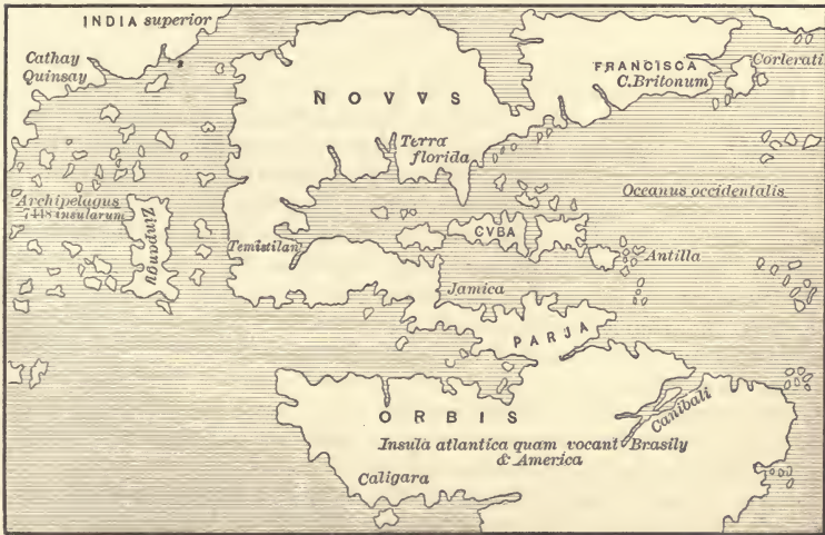
THE NEW WORLD, FROM PTOLEMY, 1530.

In the Ptolemy of 1530, in several subsequent editions, and in Munster's Cosmography of 1572 et seq., is the map of which the following is a reduction.