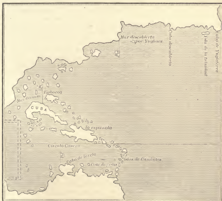
JUAN DE LA COSA'S MAP, 1500.