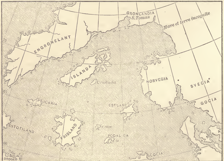
ZENO'S CHART, DRAWN ABOUT 1390.

The chart by the brothers Zeni, published with the manuscript, is of great importance as the first known map which shows any part of America. It contains internal evidences of its own authenticity, one of which is that Greenland is much better drawn than could have been done from other or extraneous sources even in 1558. I give from Kohl's fac-simile a copy of the map, omitting a few of the names.