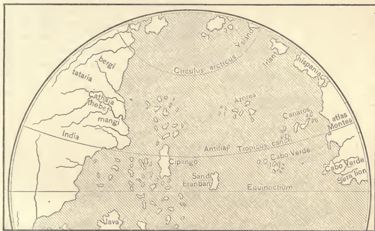
MARTIN BEHAIM'S GLOBE, 1492.

What Columbus had to contend with at this juncture was not, as I have said, old doctrines oppugnant to any new conception, but the ignorance of the masses, who held no doctrine beyond that of proximate sense, which spread out the earth's surface, so far as their dull conceptions could reach, in one universal flatness; and the knowledge of courts, whence alone the great discoverer could hope for support, was but little in advance of that of the people. Then the Church, with its usual firmness and conservatism, was against him. The monks, who were then the guardians of learning, knew, or might have known, all that Prince Henry, Columbus, and other earnest searchers had ascertained regarding the geography of the earth; but what were science and facts to them if they in any wise conflicted with the preconceived notions of the Fathers, or with Church dogmas? "Il est vrai," says Humboldt, "que les scrupules théologiques de Lactance, de St. Chrysostôme et de quelques autres Pères de l'Église, contribuèrent à