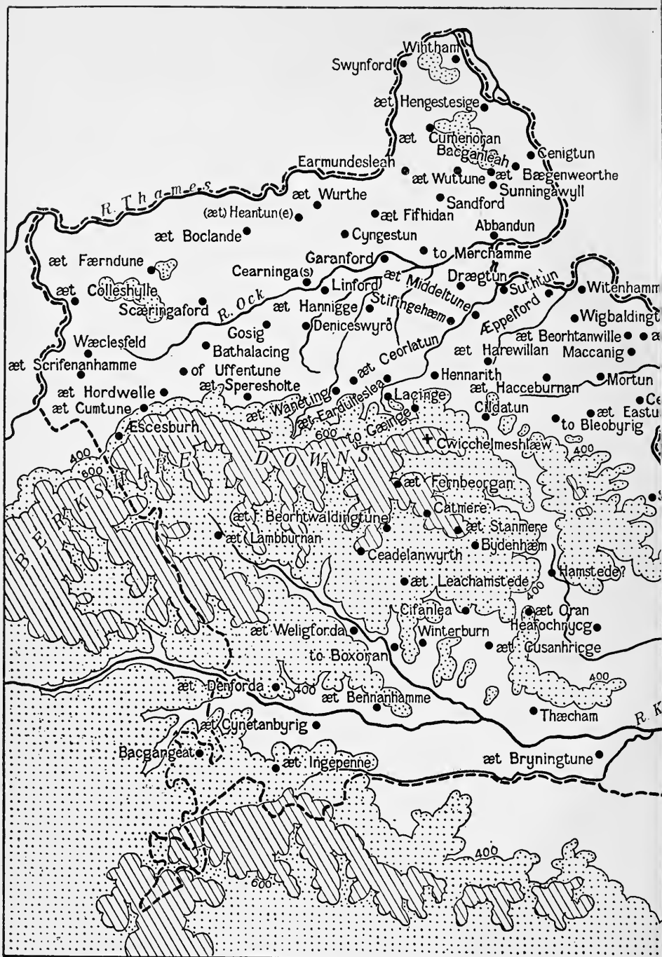
In this map it is attempted to mark the sites of all Berkshire places which are Childrey, and Bracknell, which merely occur in this period without hint of settlement. The names are given in the exact forms in which they occur in the relevant texts, &