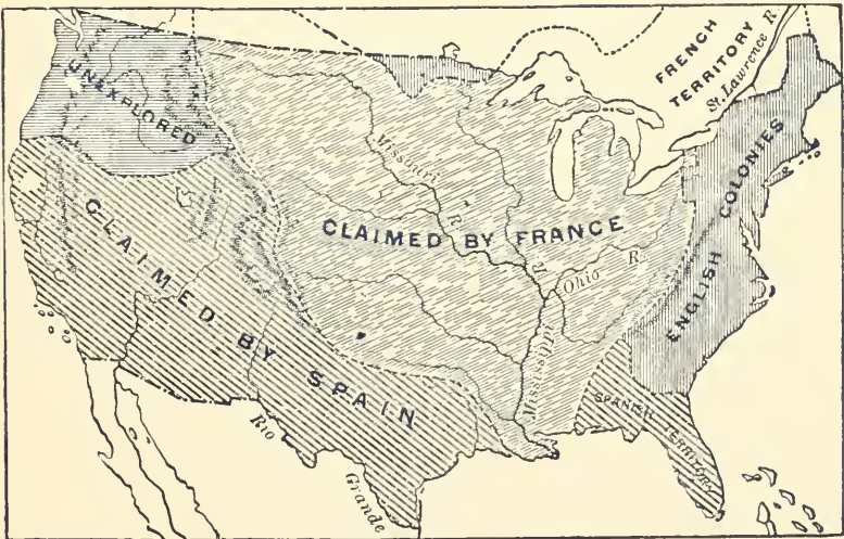
MAP SHOWING THE TERRITORY CLAIMED BY FRANCE AND BY SPAIN (ABOUT 1750 A. D.).

Before attempting to describe this journey, let us look at the course of events which had given rise to Governor Dinwiddie's demand, through his messenger, Washington, that the French should leave the country of the Ohio Valley.