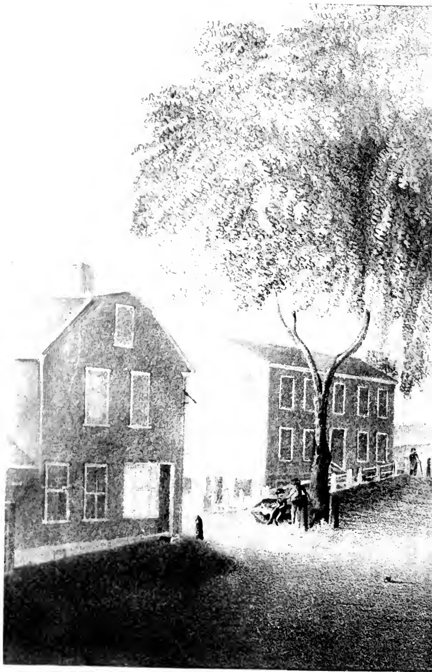
View of Town Square

Engraved for The Wilson from the drawing by S.