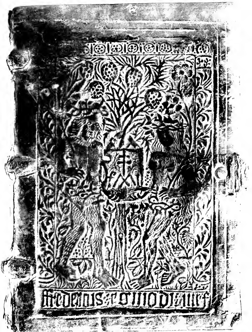
BINDING OF FREDERICK EGMONT.