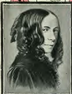
ELIZABETH BARRETT BROWNING