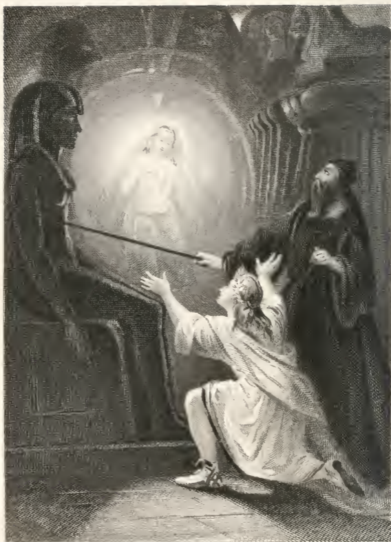
THE VISITATION OF THE KING OF THE EAST TO THE INFANT JESUS IN THE CAVE OF BETHLEHEM BY J. M. W. TURNER, 1850