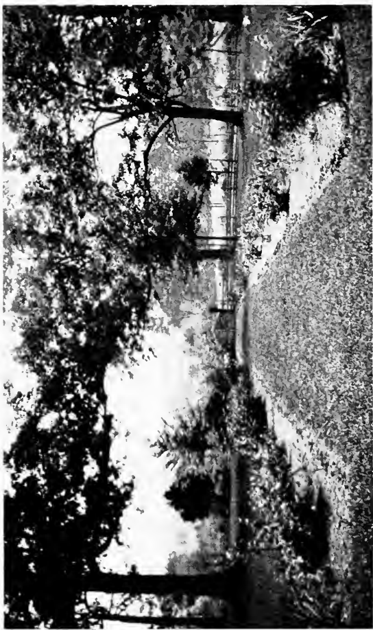
VIEW FROM FRONT DOOR AT "COTESWORTH"