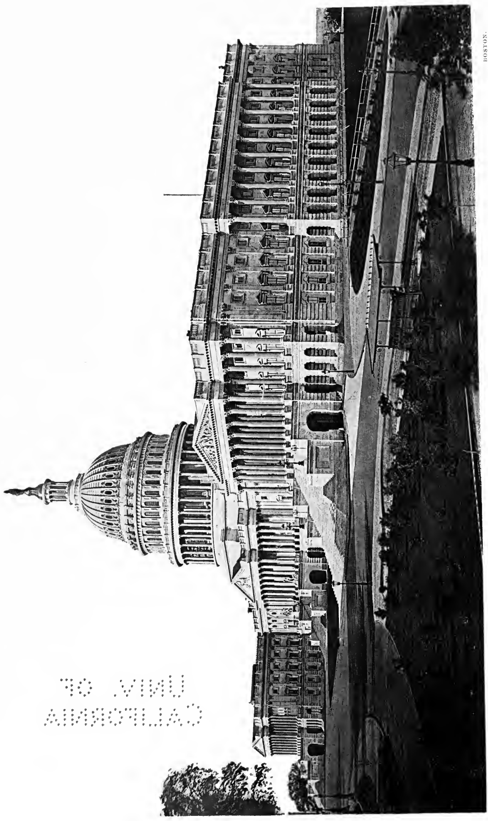
HELIOTYPE PRINTING CO.