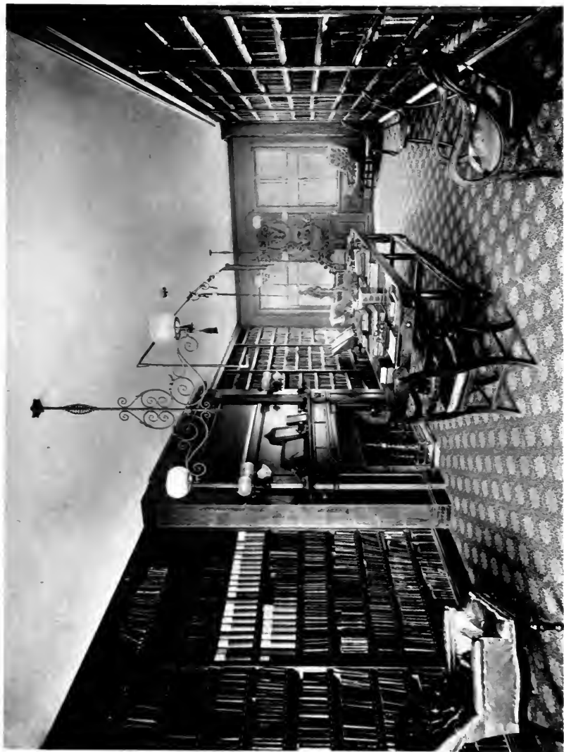
LONG ROOM—NEW CLUB