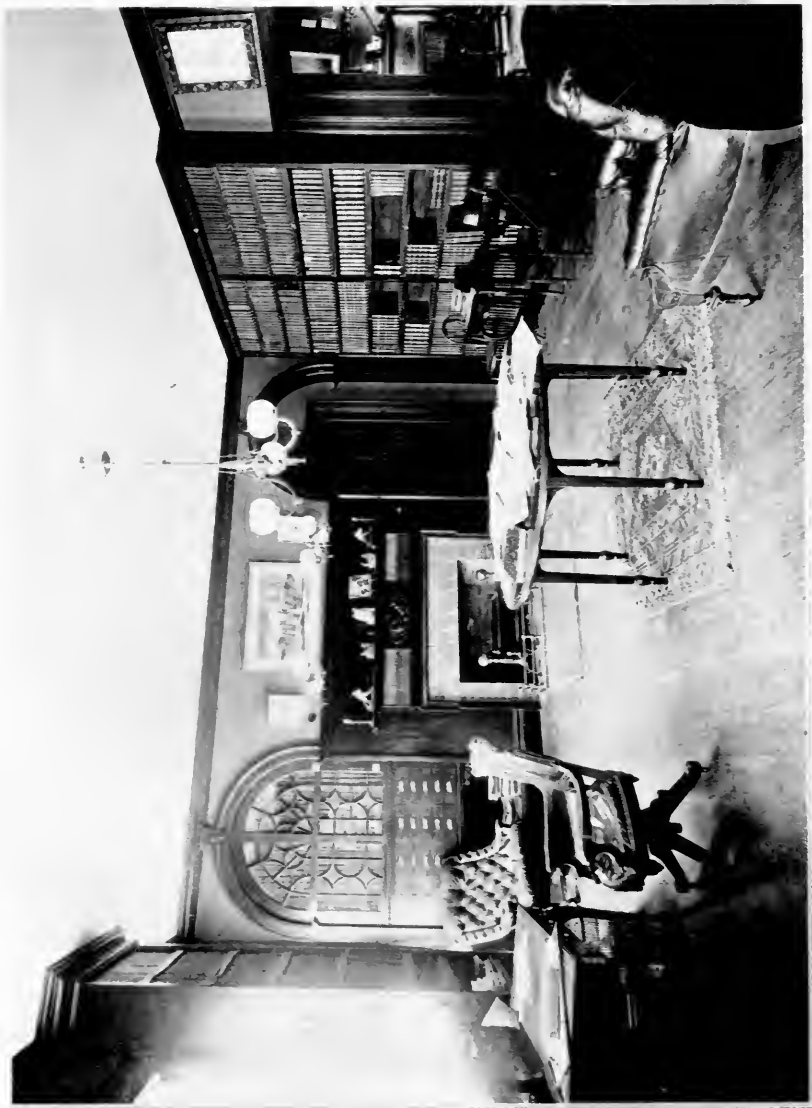
MORNING ROOM—NEW CLUB