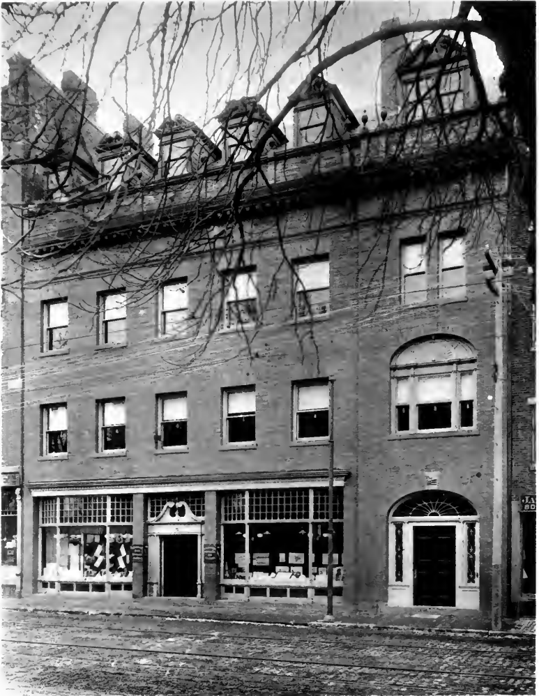
NEW CLUB HOUSE