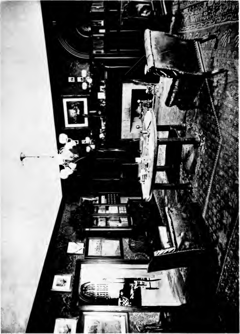
FRONT ROOM—NEW CLUB