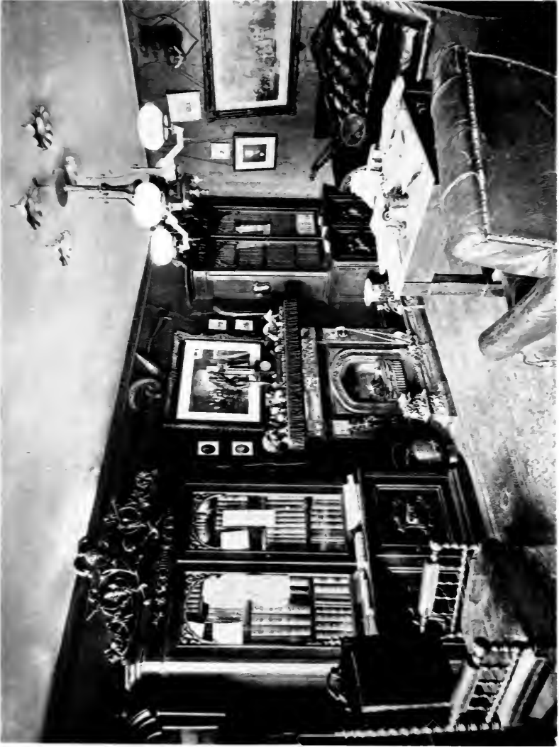
FRONT ROOM—OLD CLUB