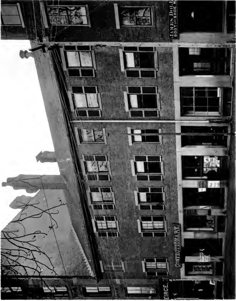
OLD CLUB HOUSE