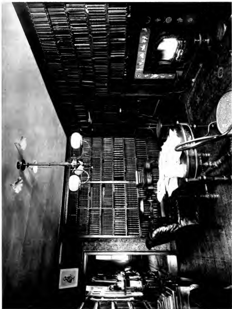
MORNING ROOM—OLD CLUB