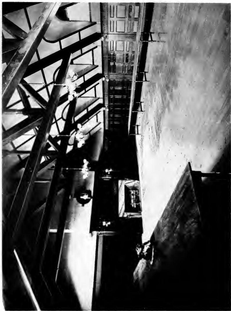
DINING HALL—NEW CLUB