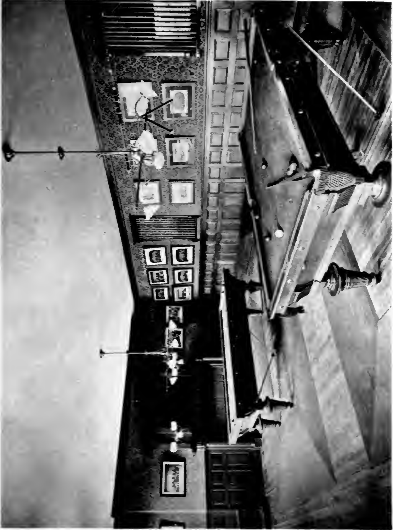
BILLIARD ROOM—NEW CLUB