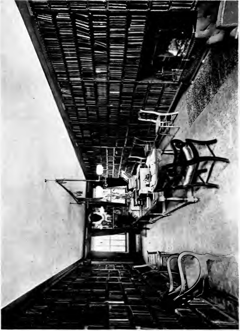
LONG ROOM—OLD CLUB