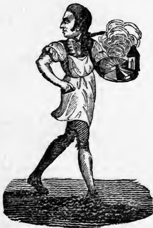
THE FLYING PYE-MAN.

Thus died Mr. Elwes, the most perfect model of human penury which has been presented to the public for a long series of years.