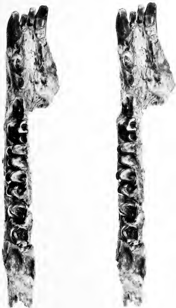
FIG. 2. Megalesthenyx hopsoni , n. sp., type, YPM 18767, occlusal view (stereophotograph, \times 1 ).